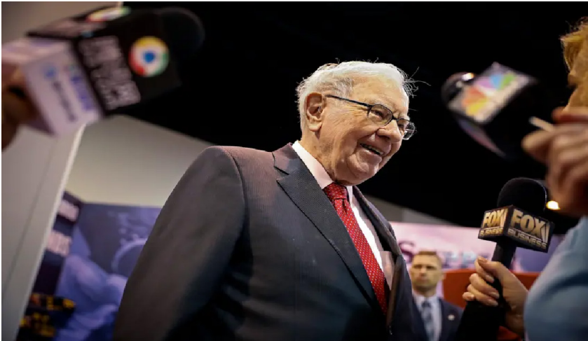
Billionaire Warren Buffett head of Berkshire Hathaway Energy