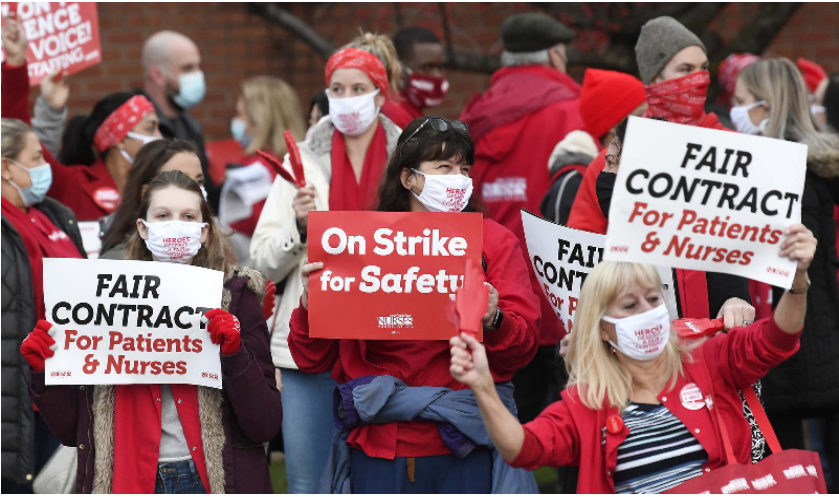
Nurses at Albany Medical Center picketed on Dec.1, asking for more personal protective equipment. They say they're having to reuse N95 masks up to 20 times.