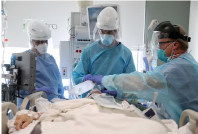
A new strain of COVID-19 has been found in California.

pert at the University of California, San Francisco.