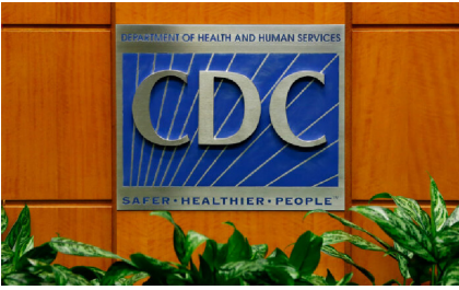
A podium with the logo for the CDC.

(CNN)The US Centers for Disease Control and Prevention on Friday released a highly anticipated update to travel guidance for people who are fully vaccinated against Covid-19, eliminating some testing and quarantine recommendations. Fully vaccinated people can travel at low risk to themselves, CDC Director Dr. Rochelle Walensky said Friday, but travel still isn’t recommended at this time because of rising numbers of coronavirus cases. The agency said that as long as coronavirus precautions are taken, including mask wearing, fully vaccinated people can travel within the United States without getting tested for Covid-19 before or self-quarantining after.