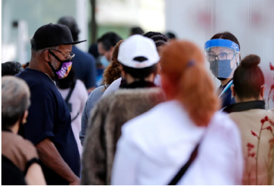
The variant, originally identified in India, carries two mutations in the virus that help it latch onto cells.

One of the variant’s mutations is similar to one found on the coronavirus variants first detected in Brazil and South Africa, and the other mutation is also found in a variant first detected in California, Chin-Hong added.