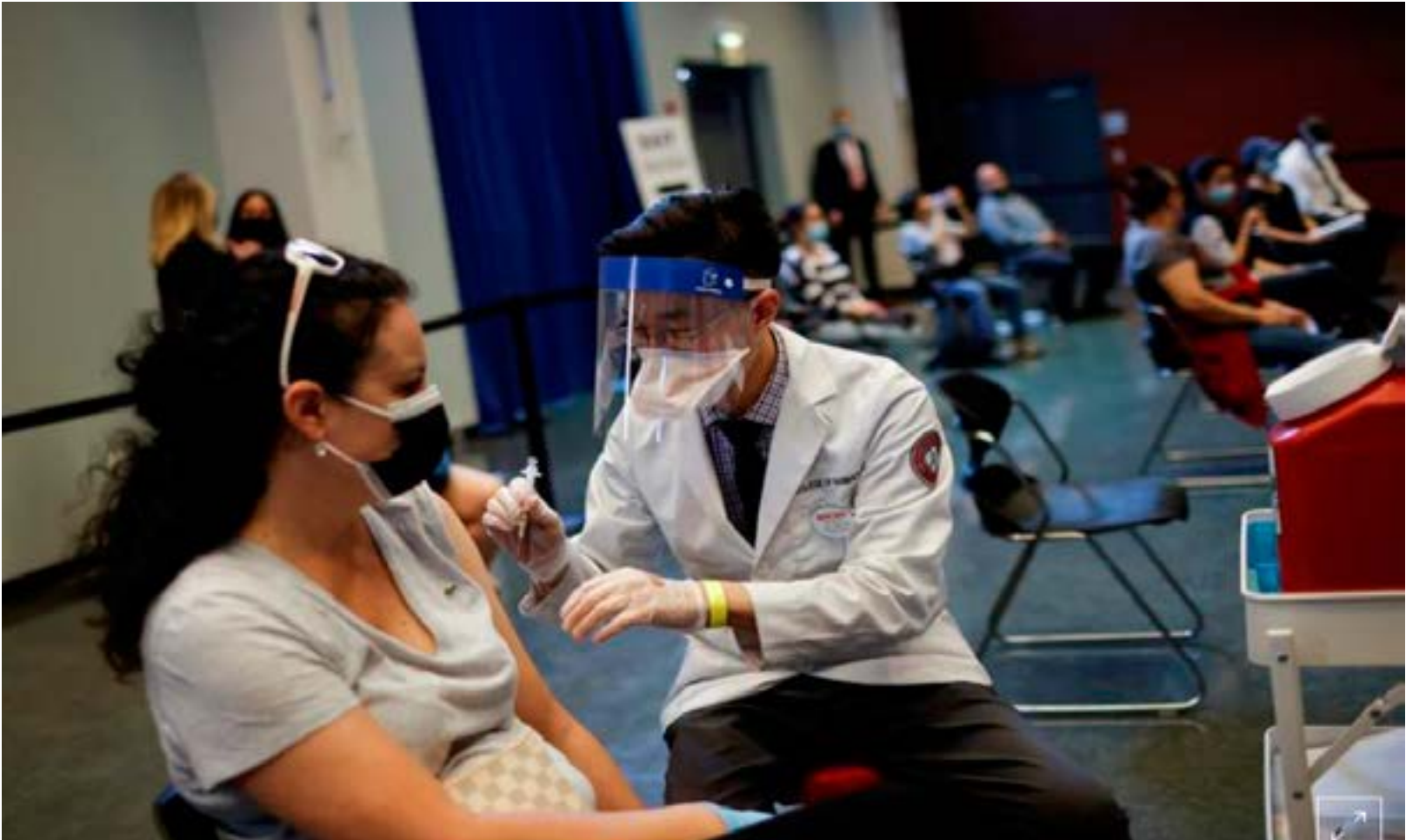
FILE PHOTO: A woman receives a dose of the Johnson & Johnson coronavirus disease (COVID-19) vaccine during a visit of U.S. Vice President Kamala Harris to a vaccination center in Chinatown, in Chicago, Illinois, U.S., April 6, 2021. REUTERS/Carlos Barria

(Reuters) - U.S. federal health agencies on Tuesday recommended pausing use of Johnson & Johnson's COVID-19 vaccine for at least a few days after six women under age 50 developed rare blood clots after receiving the shot, dealing a fresh setback to efforts to tackle the pandemic. Johnson & Johnson said it would delay rollout of the vaccine to Europe, a week after regulators there said they were reviewing rare blood clots in four recipients of the shot in the United States. South Africa also suspended use of J&J's vaccine.