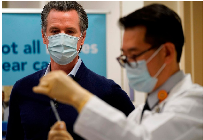
California Gov. Gavin Newsom watches as the Pfizer-BioNTech COVID-19 vaccine is prepared.