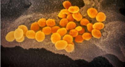
This scanning electron microscope image shows SARS-CoV-2 (orange) — also known as 2019-nCoV, the virus that causes COVID-19.

While molnupiravir is proven to interfere with coronavirus replication in infected patients, more data is required to determine whether it can prevent severe illness. Merck and Ridgeback say that more results from the U.S. clinical trial will be shared when they become available, and additional Phase 2 and 2/3 clinical studies are underway. Molnupiravir has also been tested for safety in a clinical trial in the United Kingdom. Molnupiravir works by forcing the viral enzyme that copies SARS-CoV-2's genetic material to make so many mistakes that the virus can't replicate. Still, Merck's comprehensive testing indicates that high doses of the drug are not mutagenic in animals. Emory scientists, in collaboration with top coronavirus experts at other universities, have previously shown that EIDD-2801 is highly effective at interfering with coronavirus replication and transmission in animal models and also in mice implanted with human lung tissue. EIDD-2801 has broad spectrum activity against a number of diseases of public health concern, including influenza, SARS-CoV-1, MERS, chikungunya, Ebola and equine encephalitis. The drug was initially developed with the support of the National Institute of Allergy and Infectious Diseases, the Defense Threat Reduction Agency, and the Georgia Research Alliance's Venture Development program.