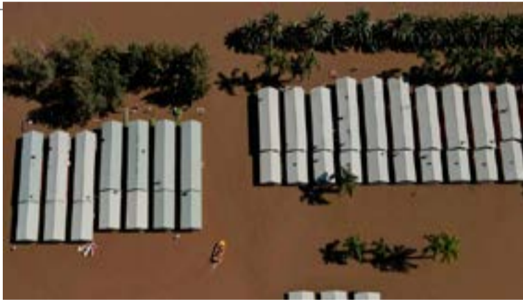
Flooding resulting from a severe weather event with prolonged rains is seen at the Hawkesbury River northwest of Sydney in Wisemans Ferry, Australia.