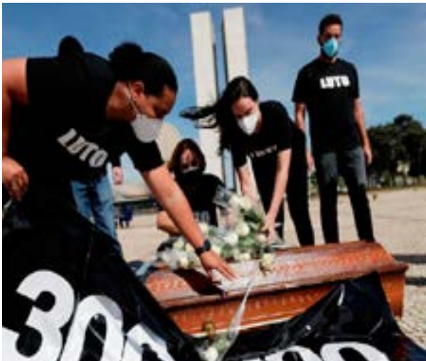
Health care workers place flowers on top a coffin to representing dead colleagues during a protest against Brazil's President Jair Bolsonaro and his handling of the coronavirus