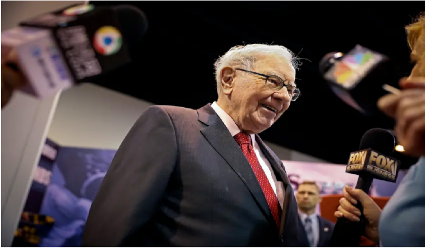
Billionaire Warren Buffett head of Berkshire Hathaway Energy

Key Points If approved, the deal would signal a move away from decades of a competitive electricity market in Texas in which all power generators in Texas are paid for the energy they produce and sell, rather than the power they could potentially generate.