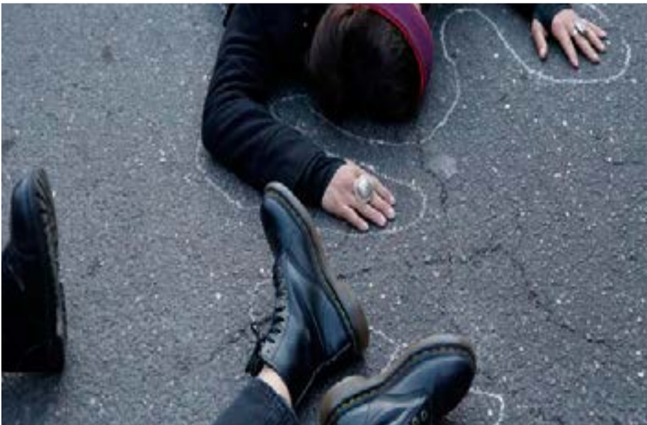
Women participate in a protest against Turkey's withdrawal from Istanbul Convention, an international accord designed to protect women, in Rome, Italy.