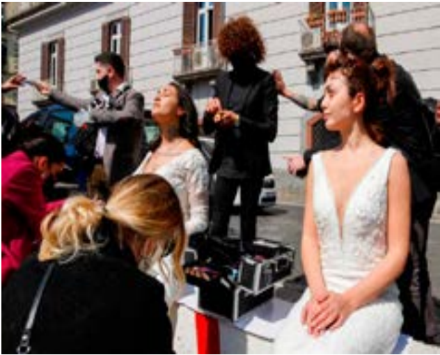
Workers from the beauty industry, including hairdressers and makeup artists, hold a protest in Plebiscito square against the coronavirus restrictions that have shut their businesses, in Naples, Italy.