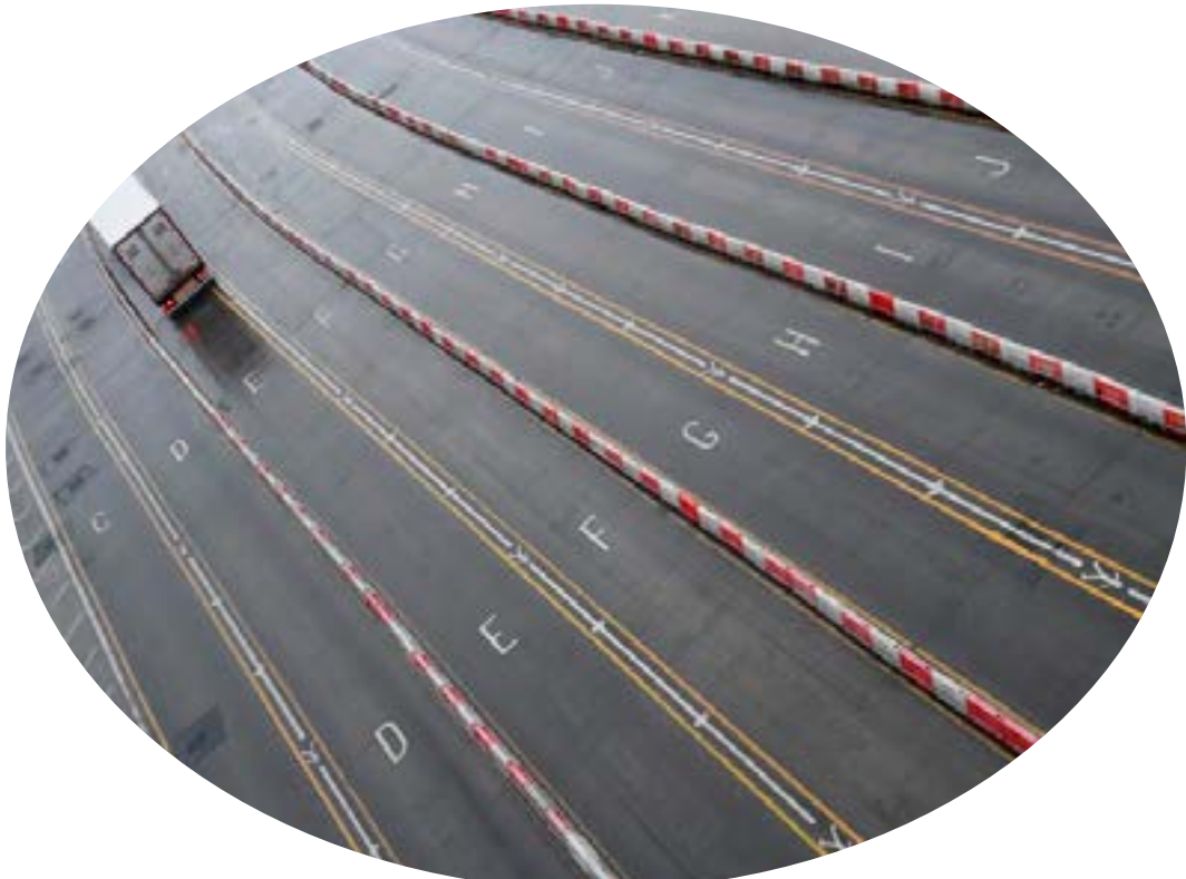
A lorry drives towards the border control at the Port of Dover, following the end of the Brexit transition period, in Dover, Britain, January 4, 2021.