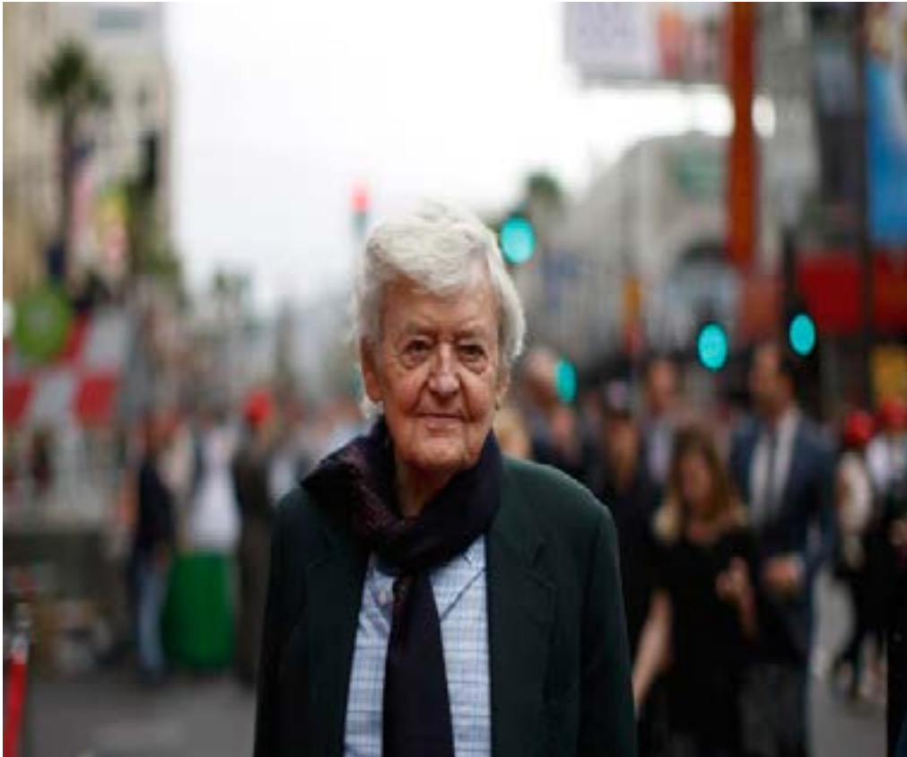
Hal Holbrook, an award-winning actor acclaimed for his one-man portrayal of American literary legend Mark Twain, died January 23 at the age of 95. In 2008, at age 82,