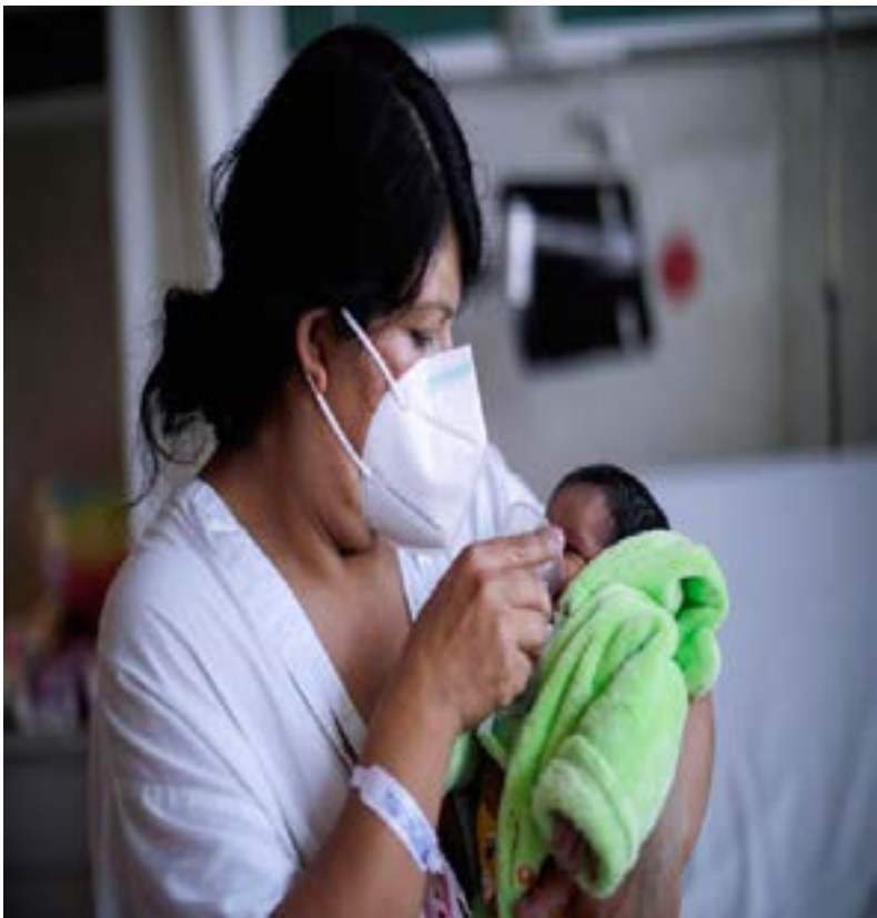
A woman infected with COVID-19 carries her baby in the maternity ward.