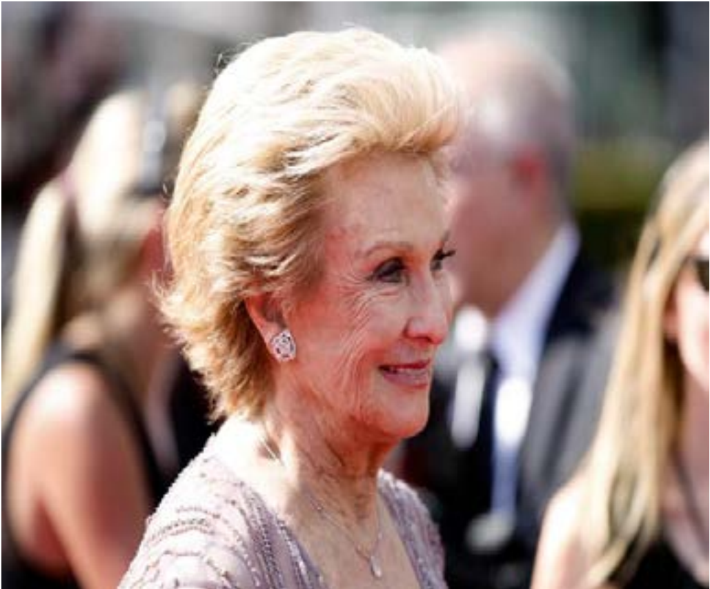
Actress Cloris Leachman, who won eight Emmys for her work on “The Mary Tyler Moore Show” and other television programs as well as an Academy Award for “The Last Picture Show,” died January 27 at the age of 94. “There was no one like Cloris