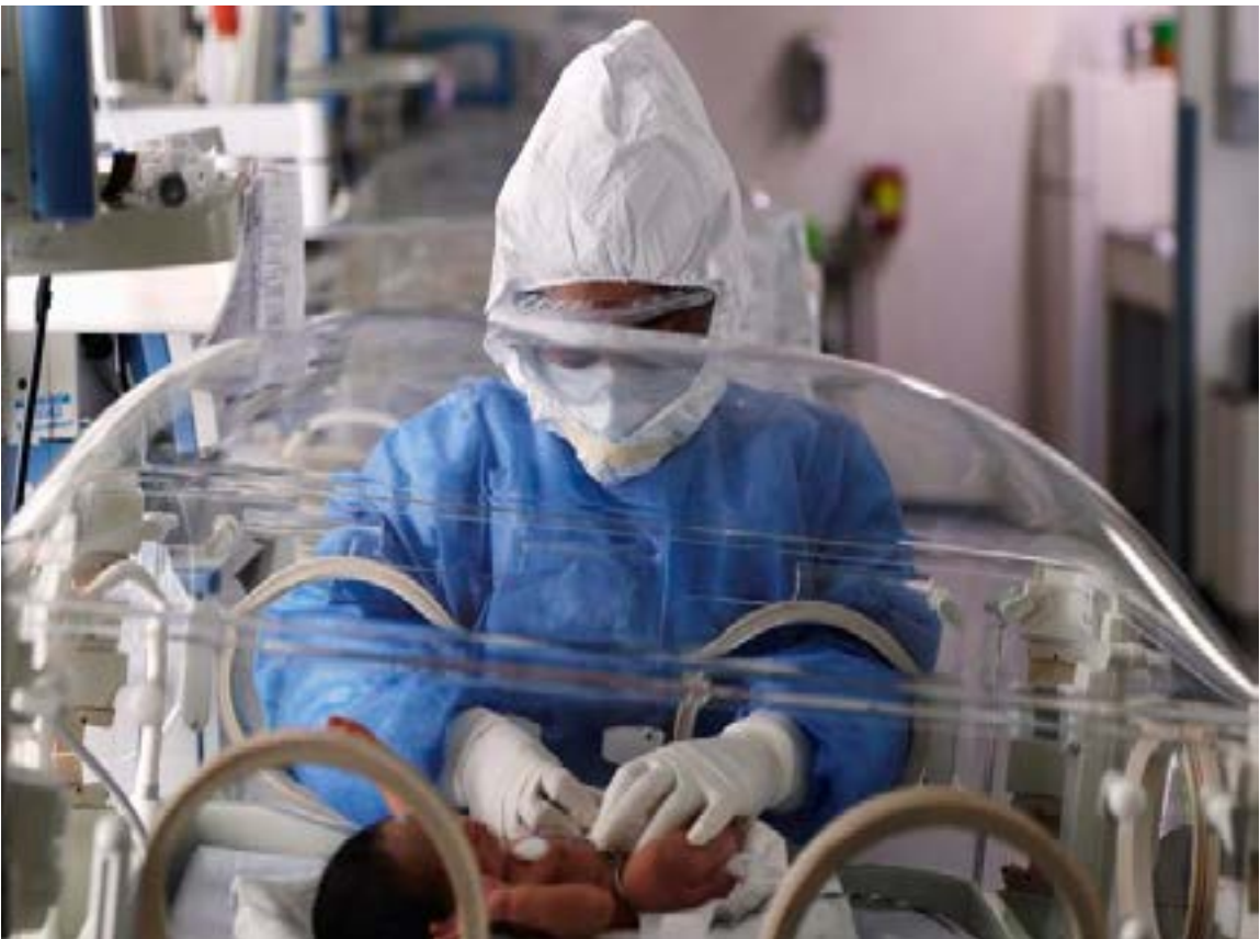
A nurse monitors the vital signs of a newborn baby infected with the coronavirus, lying in an incubator, at the COVID-19 neonatal unit of the Maternal Perinatal Hospital ‘Monica Pretelini Saenz’ in Toluca, Mexico February 4, 2021.