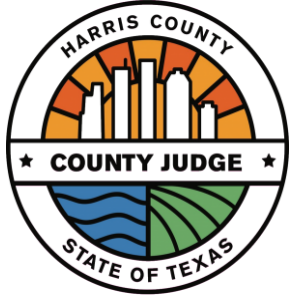
The County Connection Lina Hidalgo | Harris County Judge