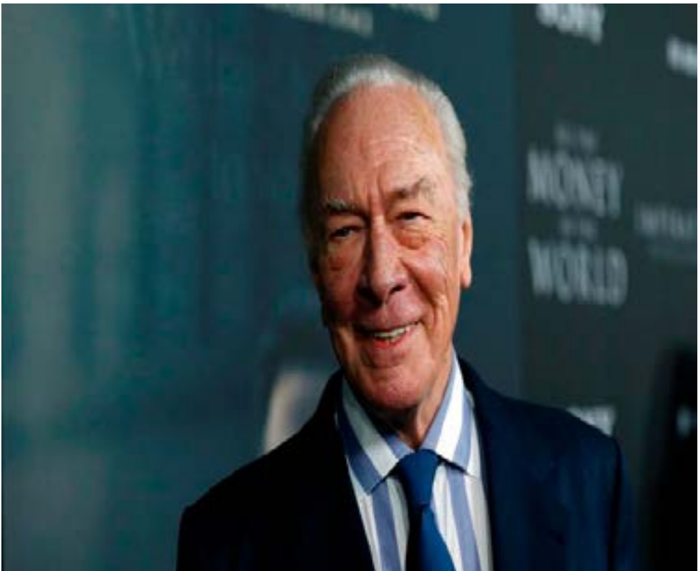
Christopher Plummer, a patrician Canadian who starred as widower Captain von Trapp opposite Julie Andrews in the blockbuster 1965 musical “The Sound Of Music” and in 2012 became the oldest actor to win an Oscar, died February 5 at 91.