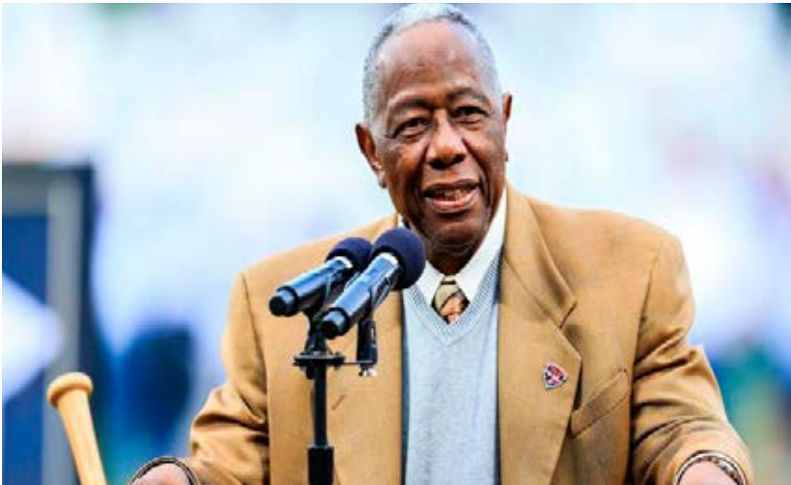
Baseball Hall of Famer Hank Aaron, the quiet, unassuming slugger who broke Babe Ruth’s supposedly unbreakable record for most home runs in a career and battled racism in the process, died January 22 at the age of 86.