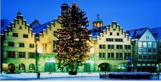
Drink a glass of gluhwein from the holiday market at the Romer Frankfurt's city hall since 1405 and enjoy a taste of Christmas past.