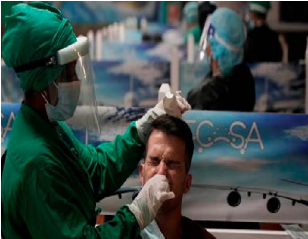
A health worker takes a swab sample from a tourist coming from Mexico upon his arrival at the Jose Marti International Airport in Havana, Cuba.