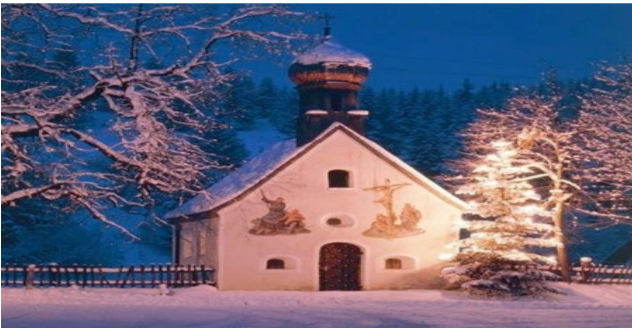
'Oh Christmas tree, oh Christmas tree': Even in its humblest attire, aglow beside a tiny chapel in Germany's Karwendel mountains, a Christmas tree is a wondrous sight.