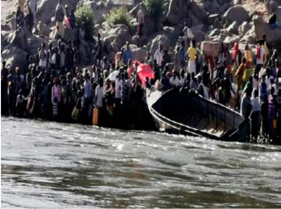
Ethiopians who fled the ongoing fighting in Tigray region prepare to cross the Setit River on the Sudan-Ethiopia border in Hamdait village in eastern Kassala state, Sudan.