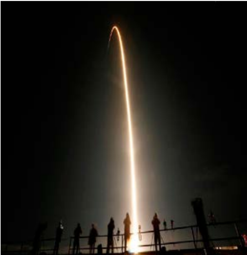
People watch as a SpaceX Falcon 9 rocket, topped with the Crew Dragon capsule, is launched carrying four astronauts on the first operational NASA commercial crew mission at Kennedy Space Center in Cape Canaveral, Florida.