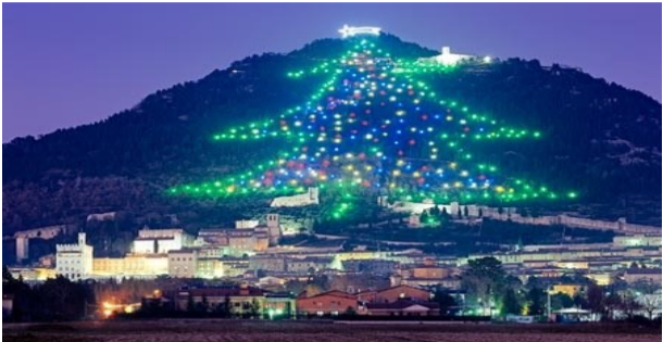
The world's largest Christmas tree display rises up the slopes of Monte Ingino outside of Gubbio, in Italy's Umbria region. Composed of about 500 lights connected by 40,000 feet of wire, the 'tree' is a modern marvel for an ancient city

The year 2020 will be remembered as the year of global pestilence brought on by the coronavirus pandemic. It has also been a time of immense loss and deep grief, the likes of which we pray to never experience again. It has also been a year of heightened bravery of front line workers and health professionals that the world has not seen in a millennial. While this year has brought us sadness and loss, there also have been miraculous triumphs in medical technology that will now serve mankind for years to come in the battle against illness. Today is the day for family, friends and being together and keeping in touch with friends a world away. Please join us on a brief journey around the world and see how the humble tree of Christmas continues to light up peoples’ spirits over the entire globe.