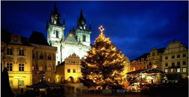
Illuminating the Gothic facades of Prague's Old Town Square, and casting its glow over the manger display of the famous Christmas market, is a grand tree cut in the Sumava mountains in the southern Czech Republic.