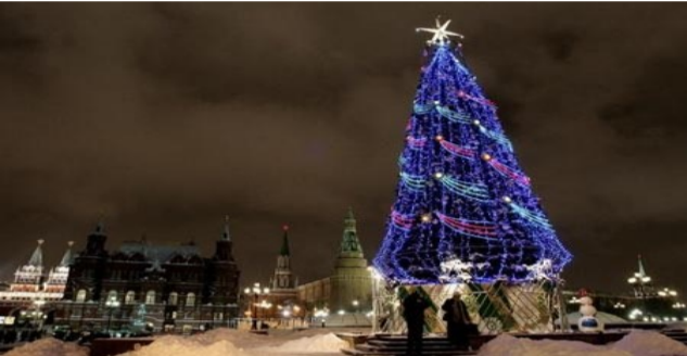
Moscow celebrates Christmas according to the Russian Orthodox calendar on Jan. 7. For weeks beforehand, the city is alive with festivities in anticipation of Father Frost's arrival on his magical troika with the Snow Maiden. He and his helper deliver gifts under the New Year tree, or yolka, which is traditionally a fir.