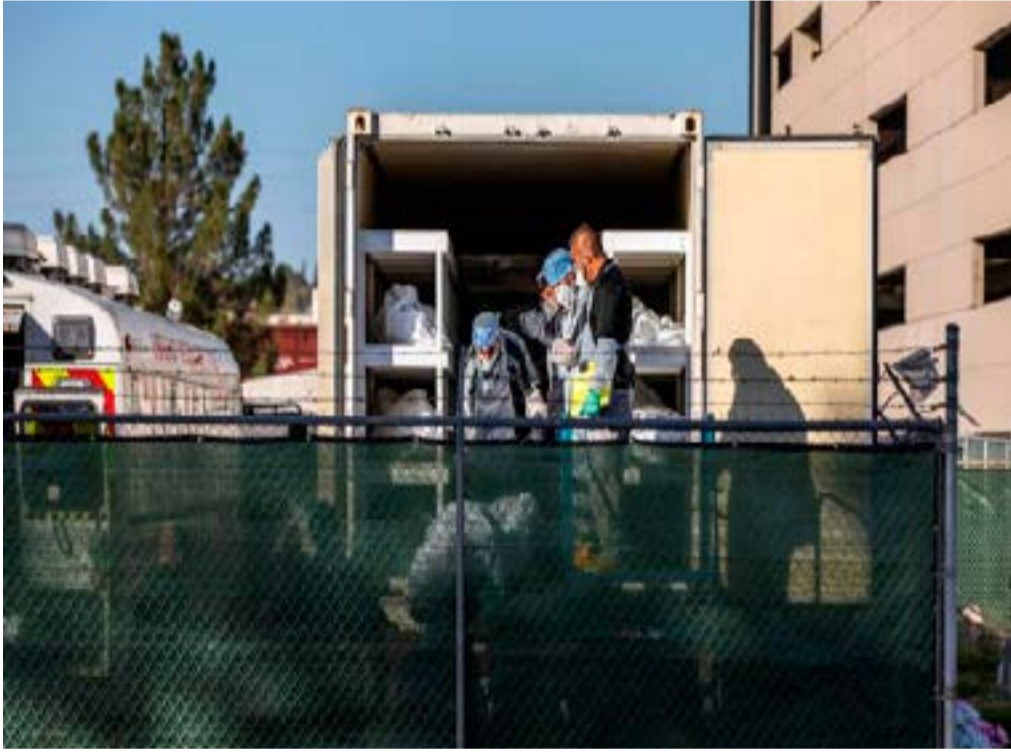
El Paso County detention inmates, also known as “trustees” (low level inmates) and Sheriff officers and morgue staff help move bodies to refrigerated trailers deployed during a surge of coronavirus deaths, outside the Medical Examiner’s Office in El Paso, Texas.