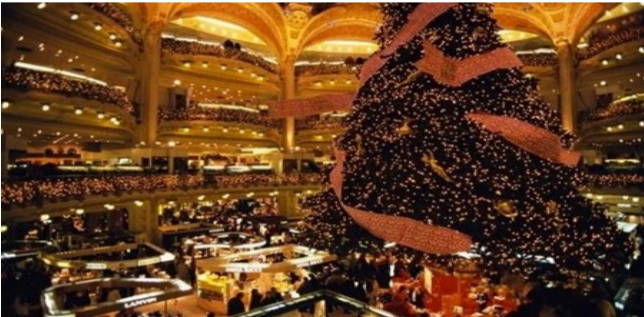
Ooh la la Galeries Lafayette! In Paris, even the Christmas trees are chic. With its monumental, baroque dome, plus 10 stories of lights and high fashion, it's no surprise this show-stopping department store draws more visitors than the Louvre and the Eiffel Tower