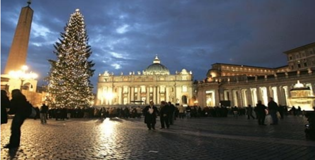
In addition to the Vatican's heavenly evergreen, St. Peter's Square in Rome hosts a larger-than-life nativity scene in front of the obelisk.