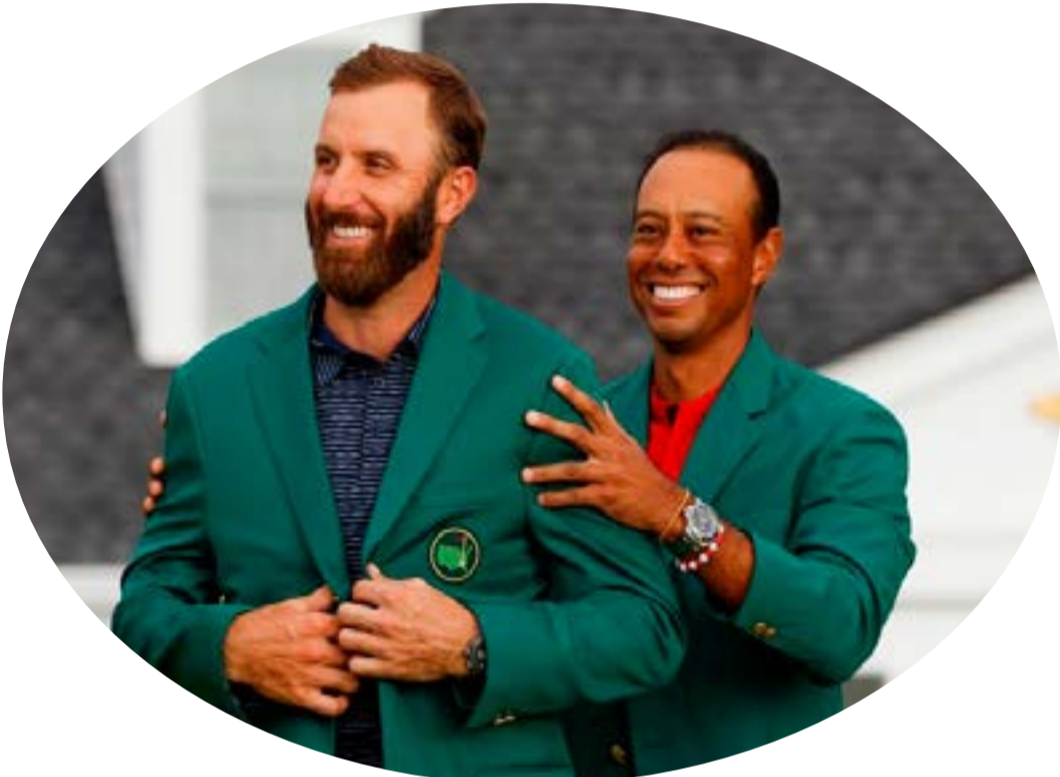
Dustin Johnson of the U.S. is presented with the green jacket by Tiger Woods of the U.S. after winning The Masters in Augusta, Georgia.