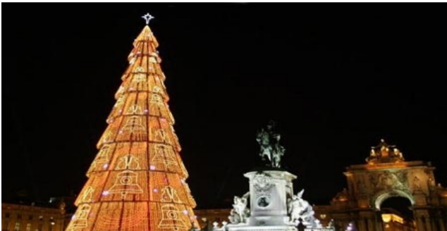
The largest Christmas tree in Europe (more than 230 feet tall) can be found in the Praça do Comércio in Lisbon, Portugal. Thousands of lights adorn the tree, adding to the special enchantment of the city during the holiday season.