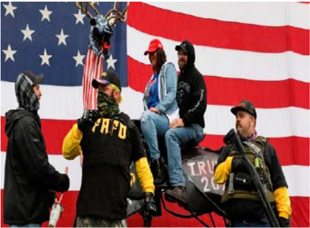
Supporters of President Donald Trump sit on the “Patriot Elk” formerly known as the”Nightmare NElk” during a “Stop the Steal” protest in Salem, Oregon.