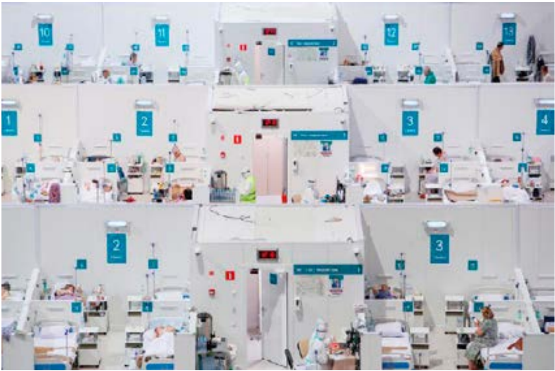
A temporary hospital in the Krylatskoye Ice Palace, where patients suffering from the coronavirus are treated, in Moscow, Russia.