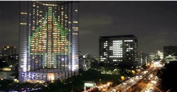
A Christmas tree befitting Tokyo's nighttime neon display is projected onto the exterior of the Grand Prince Hotel Akasaka.