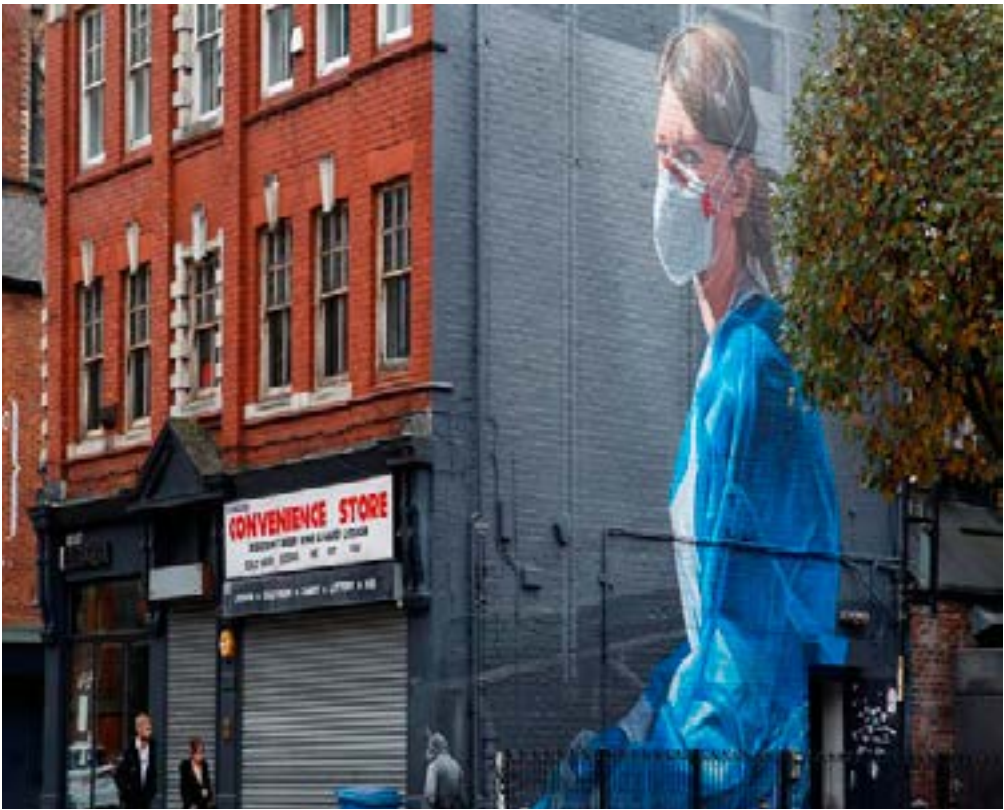
People walk past a mural in Manchester, Britain, October 19.