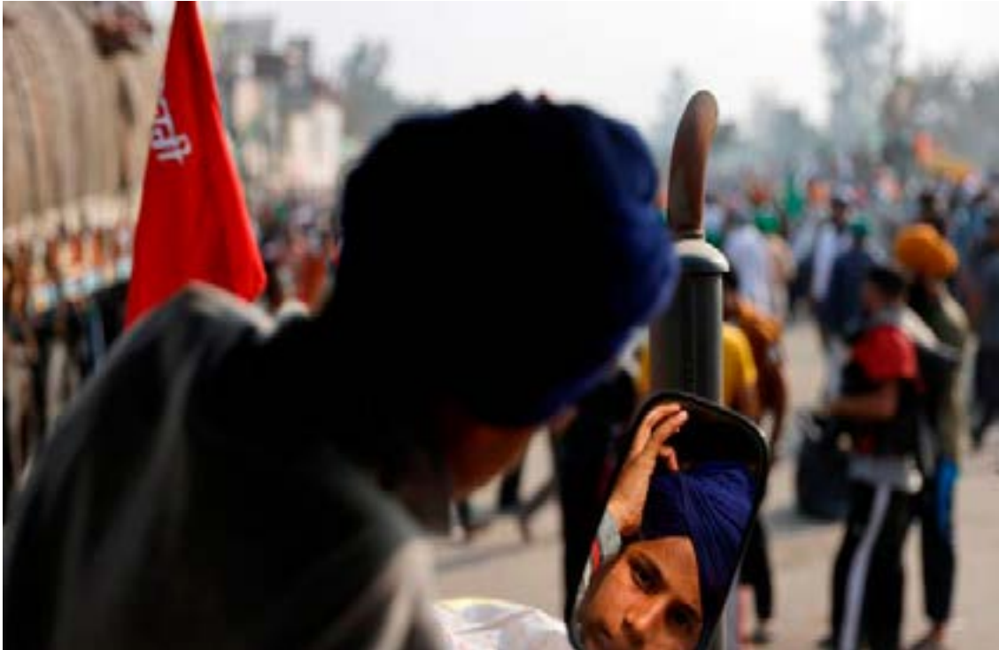
A boy adjusts his turban at a site of a protest by farmers against the newly passed farm bills at Singhu border near Delhi, India.