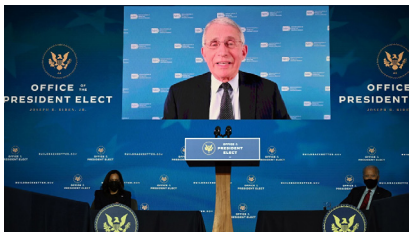
Anthony Fauci appears via video on Tuesday with Vice President-elect Harris and President-elect Biden.

• This put unprecedented stress on working parents, particularly working moms.