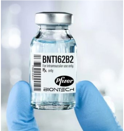
Pfizer's Covid-19 vaccine.

Pfizer plans to ship 6.4 million doses of its vaccine across the U.S. in mid-December. Health care workers and vulnerable people will receive the first doses.