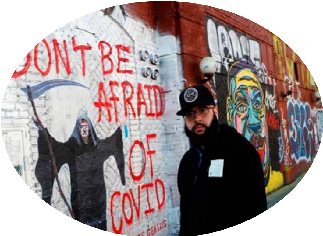
A man walks by murals along Houston Street in Manhattan, New York, October 14.