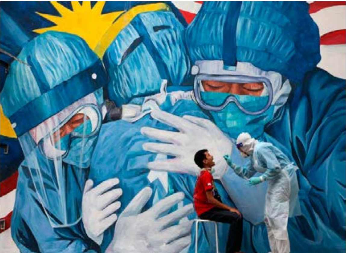
A doctor collects a swab sample from a man to be tested for the coronavirus outside Clinic Ajwa in Shah Alam, Malaysia, December 10.