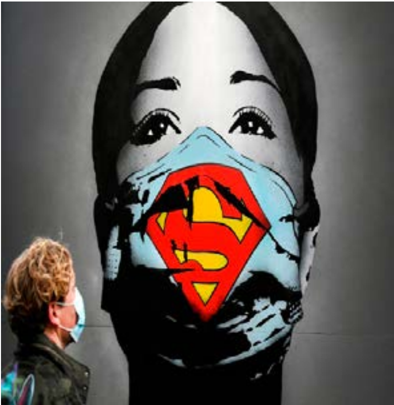
A man wearing a mask looks at street art at the International Street Art Museum following the new social restrictions announced by the Dutch government, in Amsterdam, October 14.