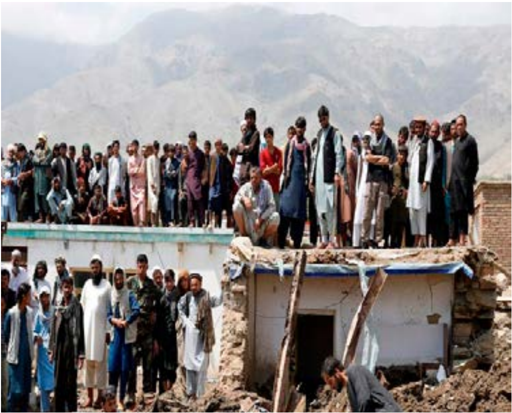
People search for victims after floods in Charikar, capital of Parwan province, Afghanistan.