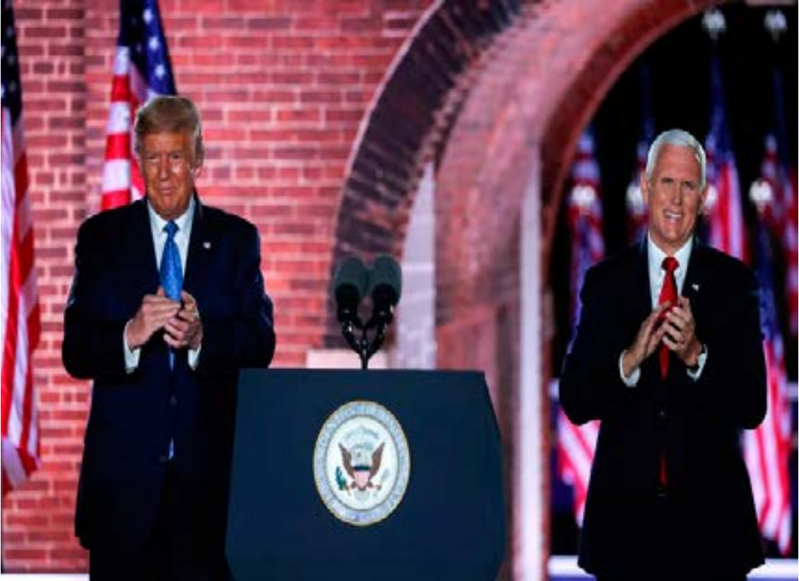
U.S. Vice President Mike Pence is joined onstage by U.S. President Donald Trump after delivering his acceptance speech as the 2020 Republican vice presidential nominee during an event of the 2020 Republican National Convention held at Fort McHenry