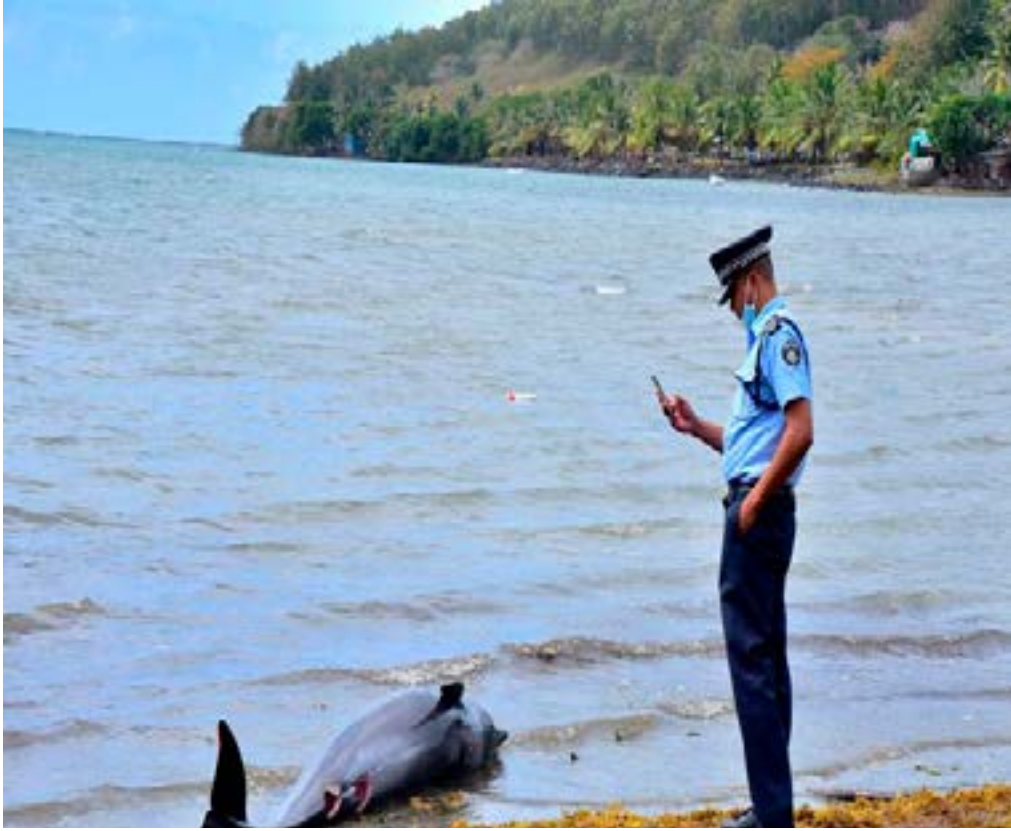
A policeman takes a photograph of a carcass of a dolphin that died and was washed up on shore at the Grand Sable, Mauritius.