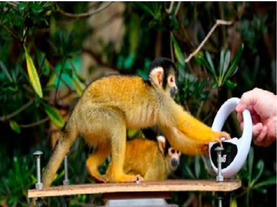
Zoo keeper Tony Cholerton uses an electronic identification chip reader on a squirrel monkey as it stands on weighing scales at the ZSL London Zoo 2020 weigh-in.