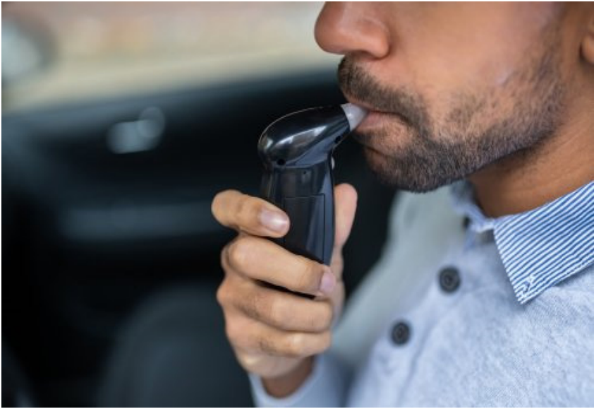
“Breathalyzer” device which works like a drunk-driving test will be able to check for COVID-19.