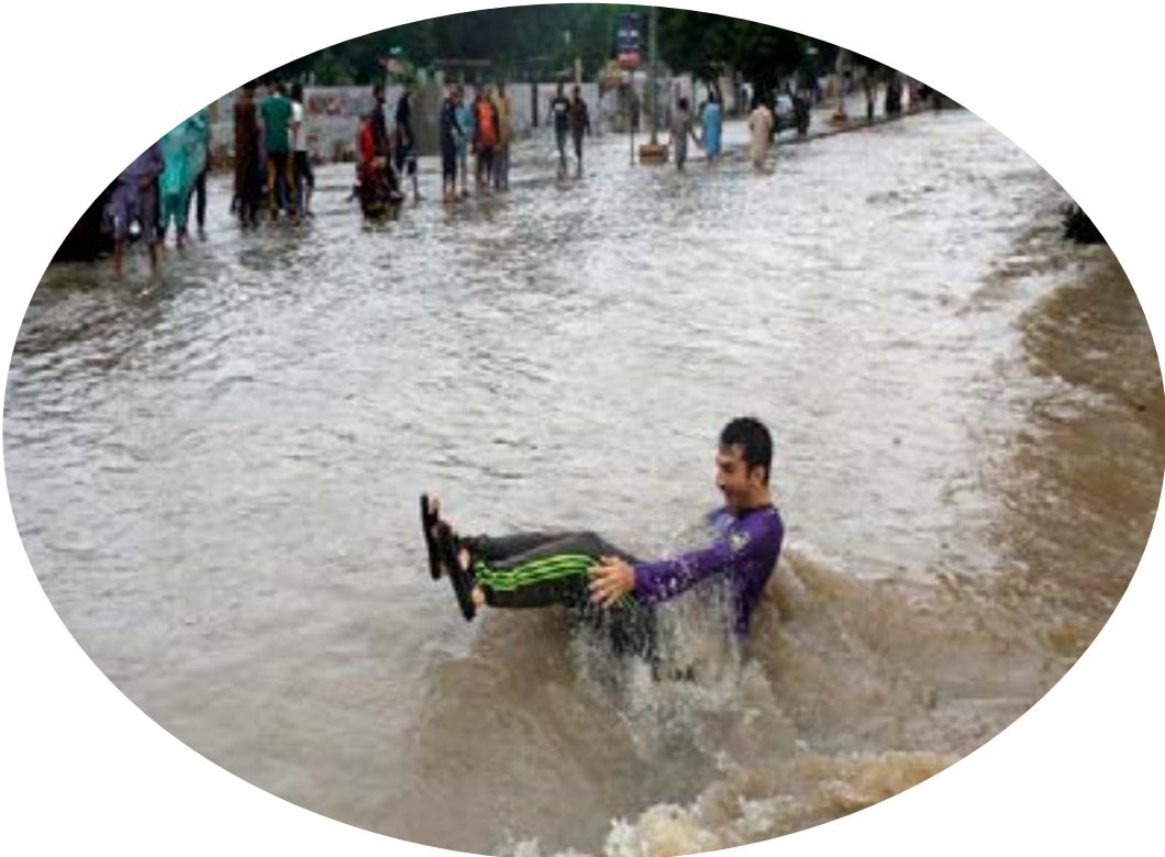
A man loses his balance while crossing a flooded street during monsoon rain in Karachi, Pakistan.