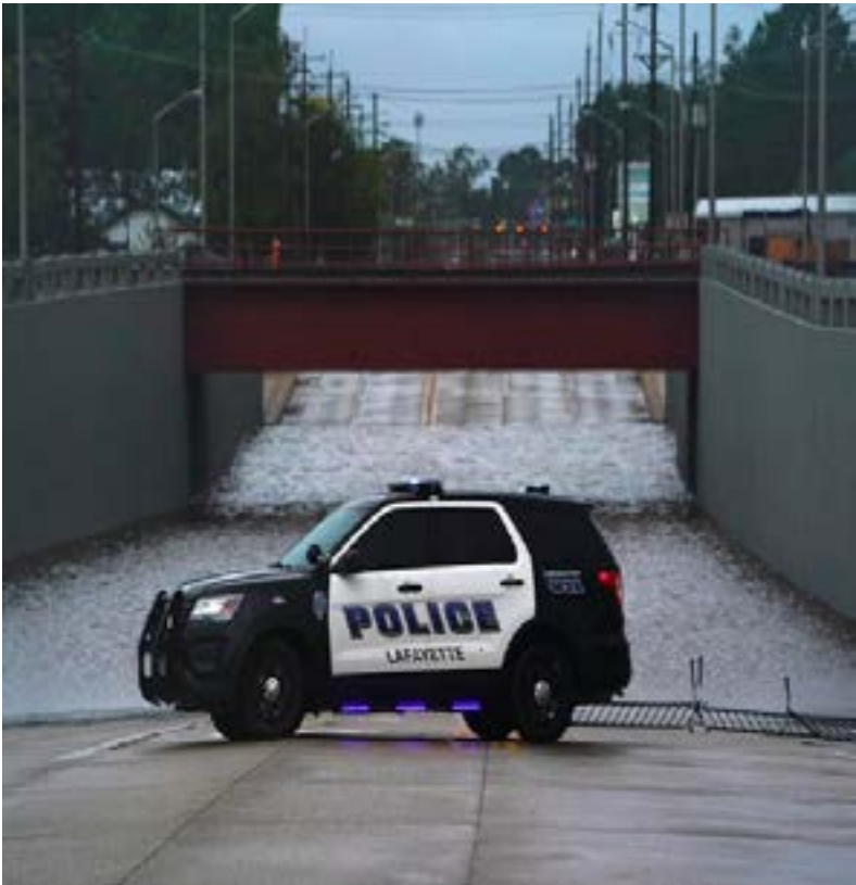
A police car is seen next to a flooded underpass after Hurricane Laura passed through Lafayette, Louisiana.