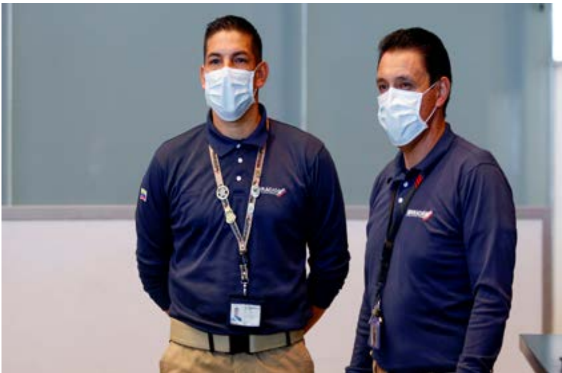
Colombian Migration office staff wear protective face masks to avoid contracting coronavirus, at El Dorado international airport in Bogotá