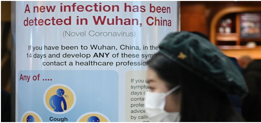
Lady wearing a mask walks past a travel advisory sign in New York’s John F. Kennedy International Airport.