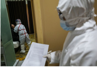
Medical staff take samples from a person at a quarantine zone in Wuhan, Feb. 4.

ready been filled many times over when China announced on Jan. 23 that it would take the unprecedented step of sealing off Wuhan, preventing possible pathogen carriers from traveling out, but also preventing most people from coming in. The quarantine soon widened to encompass nearly the entire province.