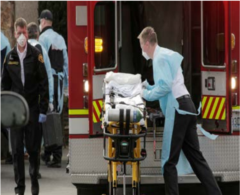
A medic prepares a stretcher to transfer a patient into an ambulance at the Life Care Center of Kirkland, the long-term care facility linked to several confirmed coronavirus cases in the state, in Kirkland