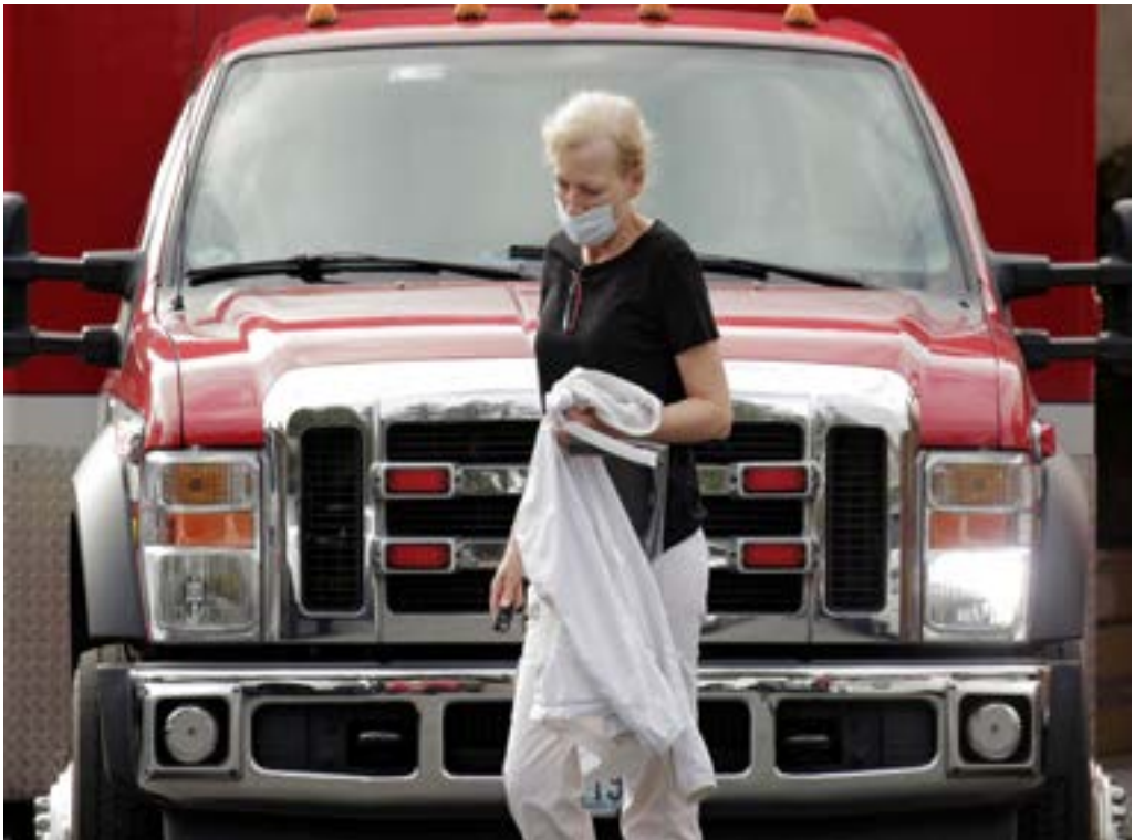
A woman walks past an ambulance at the Life Care Center of Kirkland, the long-term care facility linked to several confirmed coronavirus cases in the state, in Kirkland