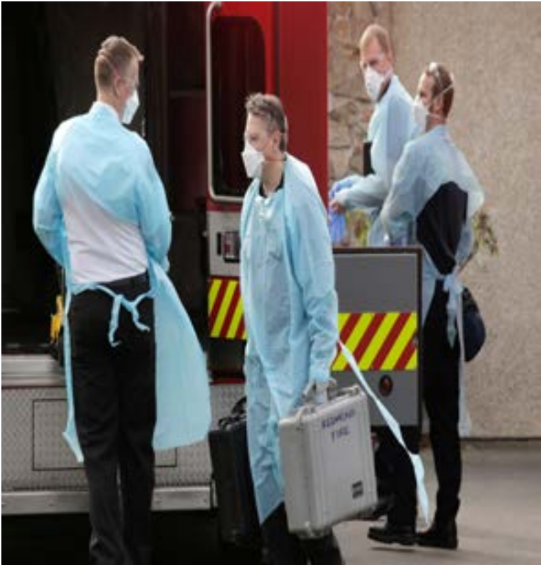
Medics prepare to transfer a patient into an ambulance at the Life Care Center of Kirkland in Washington