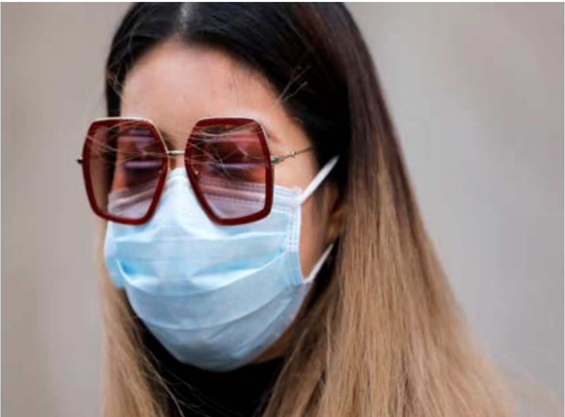
A woman in a face mask walks in the downtown area of Manhattan, New York City, after further cases of coronavirus were confirmed in New York