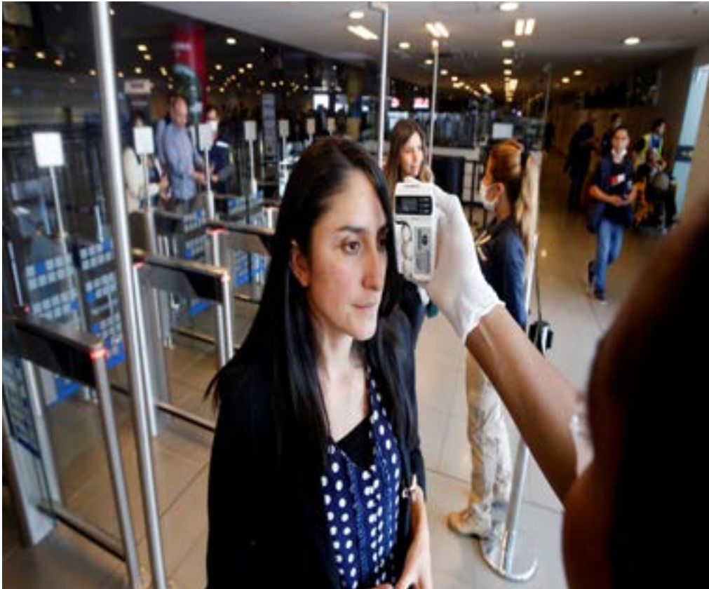
Medical staff of the Ministry of Health check passengers' temperature, amid coronavirus outbreak, upon their arrival to El Dorado international airport in Bogotá