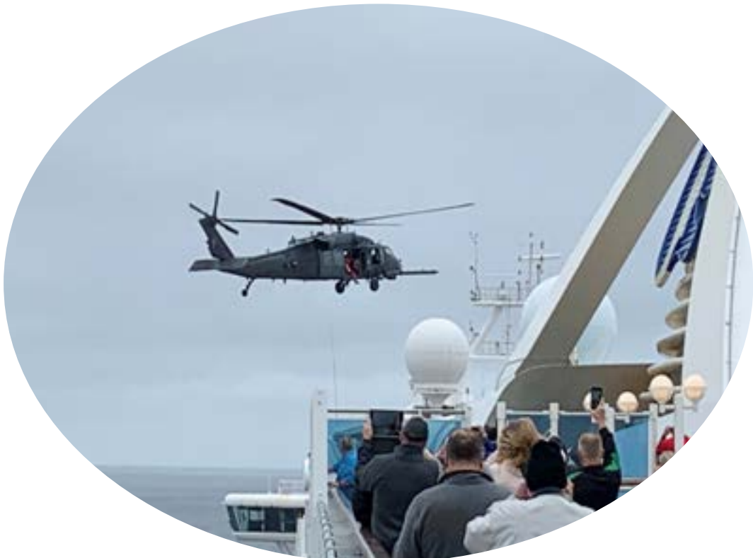
Passengers on board the Grand Princess cruise ship off San Francisco watch while a U.S. military helicopter hovers above the deck