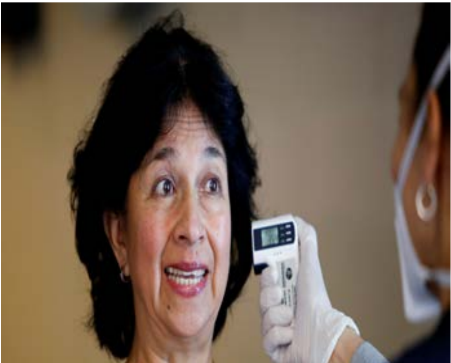
Medical staff of the Ministry of Health checks passengers' temperature, amid coronavirus outbreak, upon their arrival to El Dorado international airport in Bogotá