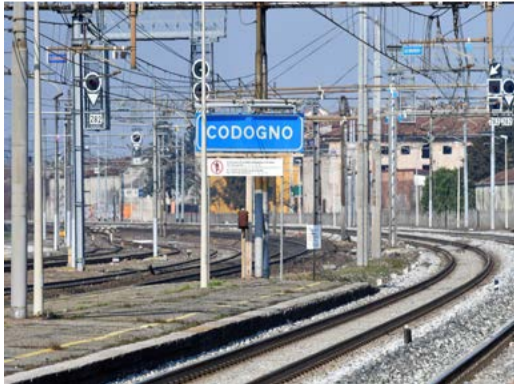
Codogno's train station, which was closed by authorities blocking public transport due to a coronavirus outbreak, is seen empty in Codogno, Italy, February 22, 2020.