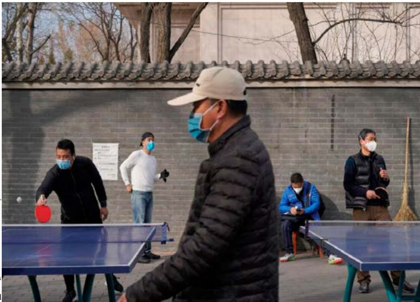
People wearing face masks play table tennis at a park, following an outbreak of the novel coronavirus in the country, in Beijing, China February 21, 2020.

In total, China has reported 75,569 cases to the WHO,