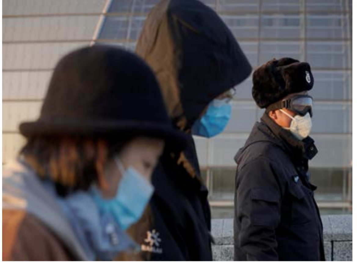
People wearing face masks walk near the National Centre for the Performing Arts, following an outbreak of the novel coronavirus in the country, in Beijing