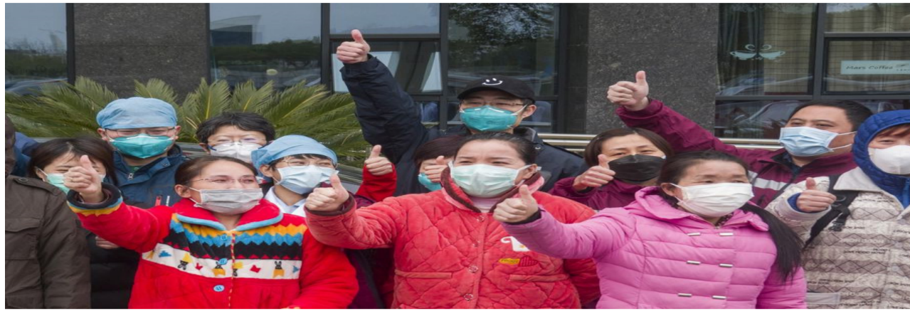
The recovered patients with severe novel coronavirus pneumonia (NCP) pose for photos with medical staff at the west campus of Wuhan Union Hospital in Wuhan, central China's Hubei Province, Feb. 19, 2020.