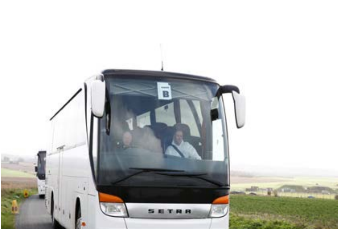
Passengers who have been under quarantine on a coronavirus-stricken cruise ship off the coast of Japan, leave RAF Boscombe Down in Amesbury