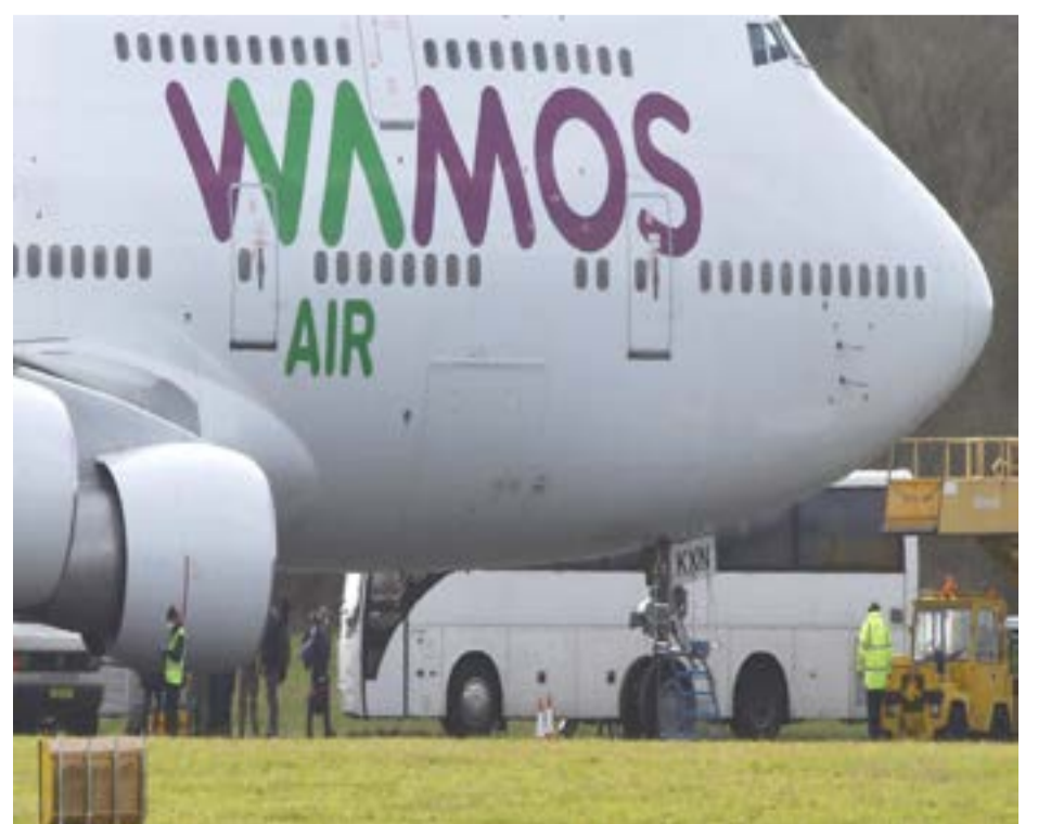
Passengers who have been under quarantine on a coronavirus-stricken cruise ship off the coast of Japan, arrive at RAF Boscombe Down in Amesbury