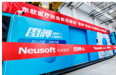
Photo above shows the remote CT equipment developed by Neusoft Medical Systems Co., Ltd. in Shenyang, northeast China's Liaoning Province.

a type of remote CT equipment in just seven days.