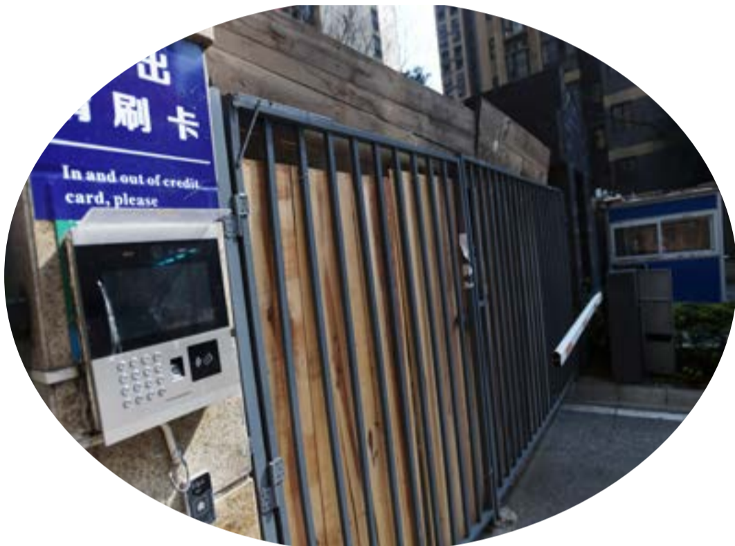
A boarded-up entrance to a residential compound is seen in Wuhan, the epicentre of the novel coronavirus outbreak, Hubei province, China February 22, 2020. REUTERS/Stringer CHINA OUT.