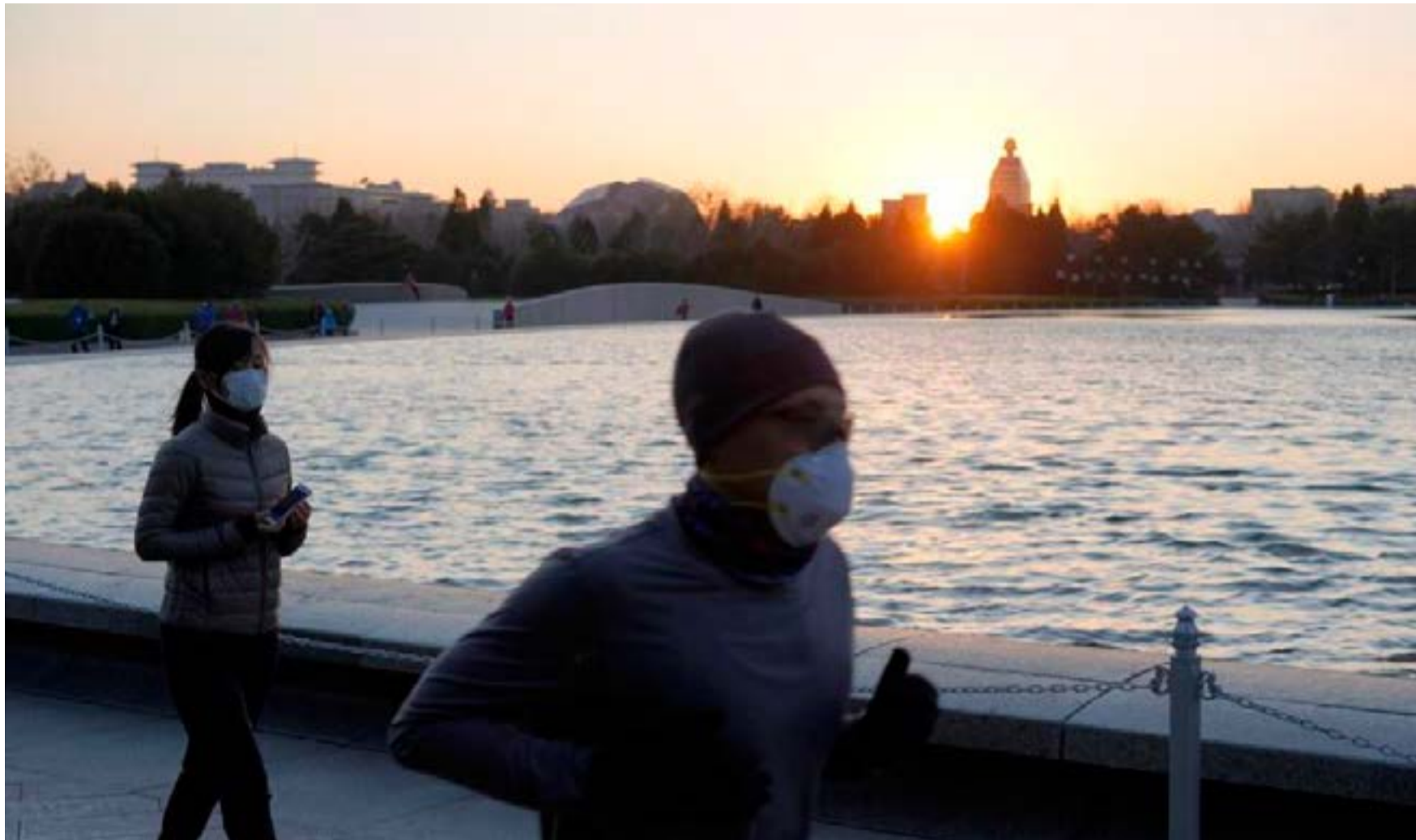
A man wearing face mask jogs near the National Centre for the Performing Arts, following an outbreak of the novel coronavirus in the country, in Beijing, China February 22, 2020. REUTERS/Stringer NO RESALES. NO ARCHIVES.

(Reuters) - China reported a sharp decrease in new deaths and cases of the coronavirus on Saturday but a doubling of infections in South Korea and 10 new cases in Iran added to unease about its rapid spread and global reach.