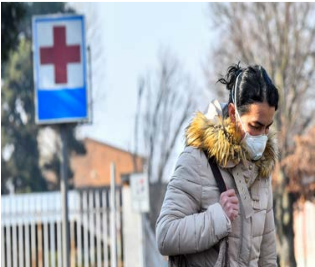
A woman wearing a face mask leaves the hospital of Codogno amid a coronavirus outbreak in northern Italy, in Codogno, Italy, February 22, 2020.