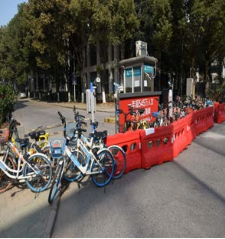
Shared bicycles and barricades block the way in Wuhan, the epicentre of the novel coronavirus outbreak, Hubei province, China February 22, 2020.