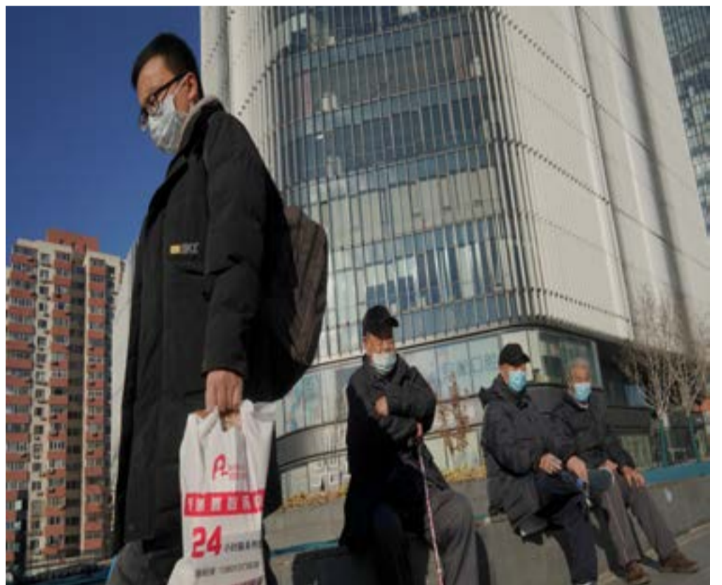
Men wearing face masks sit by the road, following an outbreak of the novel coronavirus in the country, in Beijing's central business district