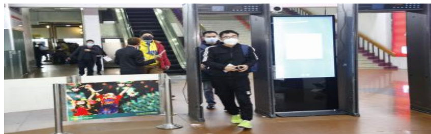
The travel bans run counter to advice from the World Health Organization.