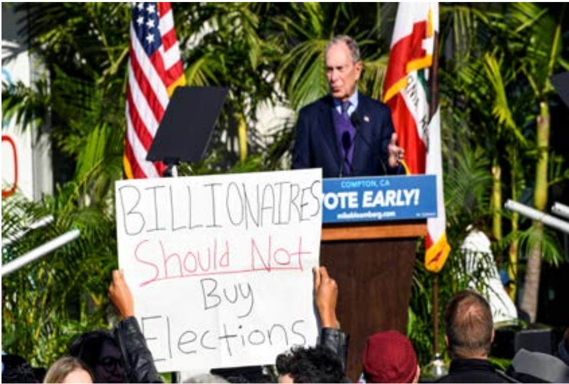
Democratic presidential candidate Michael Bloomberg visits Compton