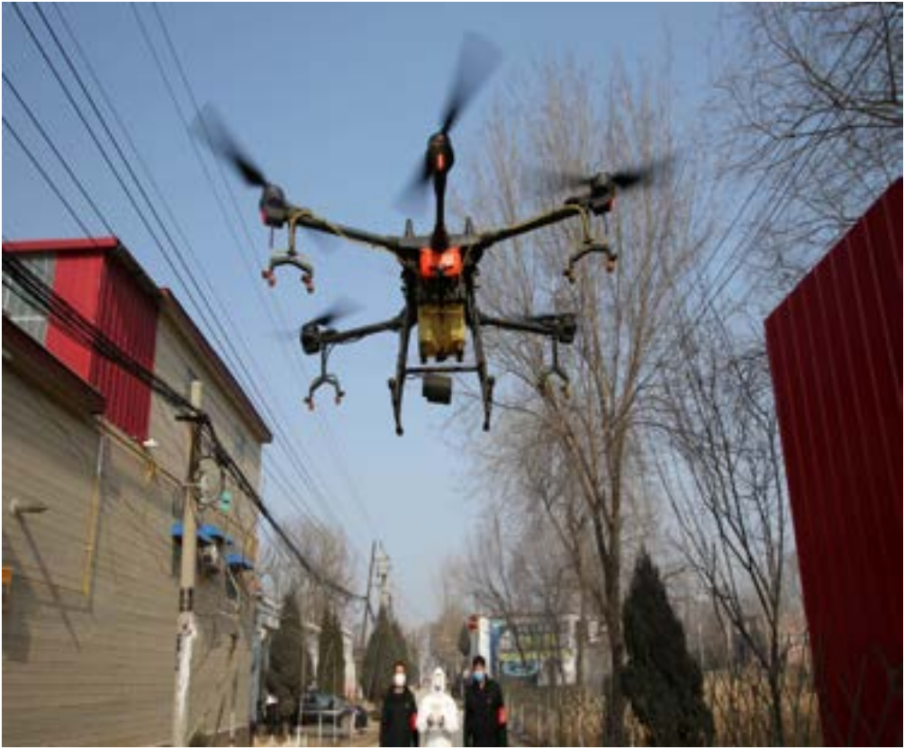
Volunteer in protective suits controls a drone to spray disinfectants at Zhengwan village, as the country is hit by an outbreak of the new coronavirus, in Handan