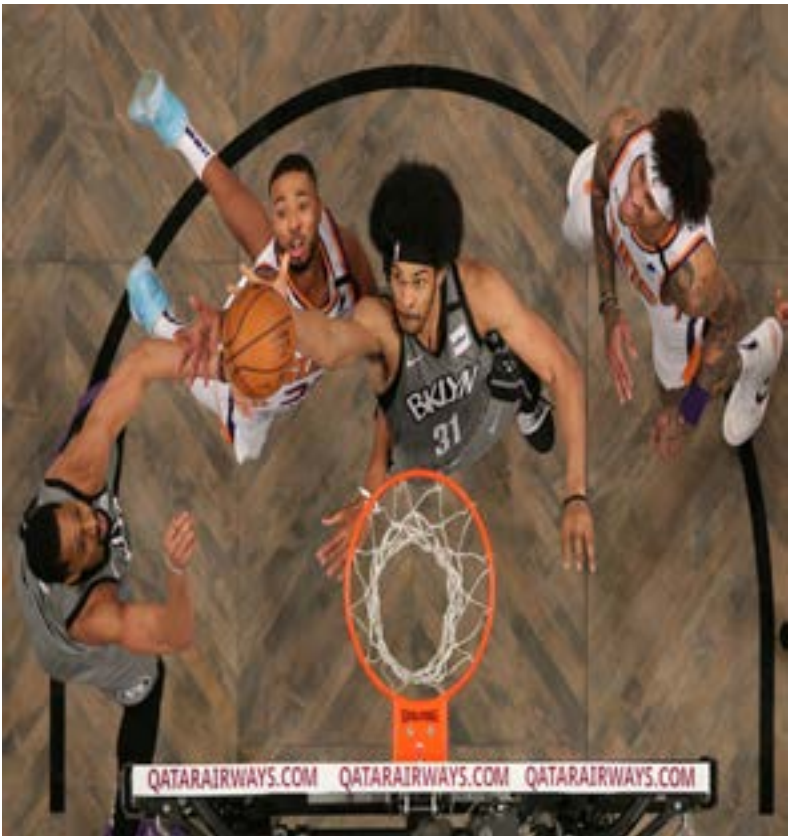
Feb 3, 2020; Brooklyn, New York, USA; Brooklyn Nets center Jarrett Allen (31) and point guard Spencer Dinwiddie (left) fight for a rebound against Phoenix Suns small forwards Mikal Bridges (second from left) and small forward Kelly Oubre Jr. (right) during the second quarter at Barclays Center. TPX IMAGES OF THE