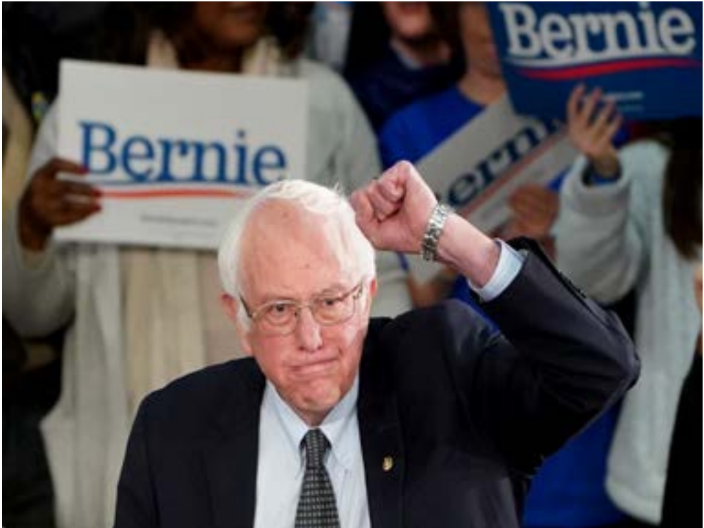
Democratic presidential candidate Senator Bernie Sanders arrives to speak at a rally at the Drake University Olmsted Center in Des Moines, Iowa, U.S.