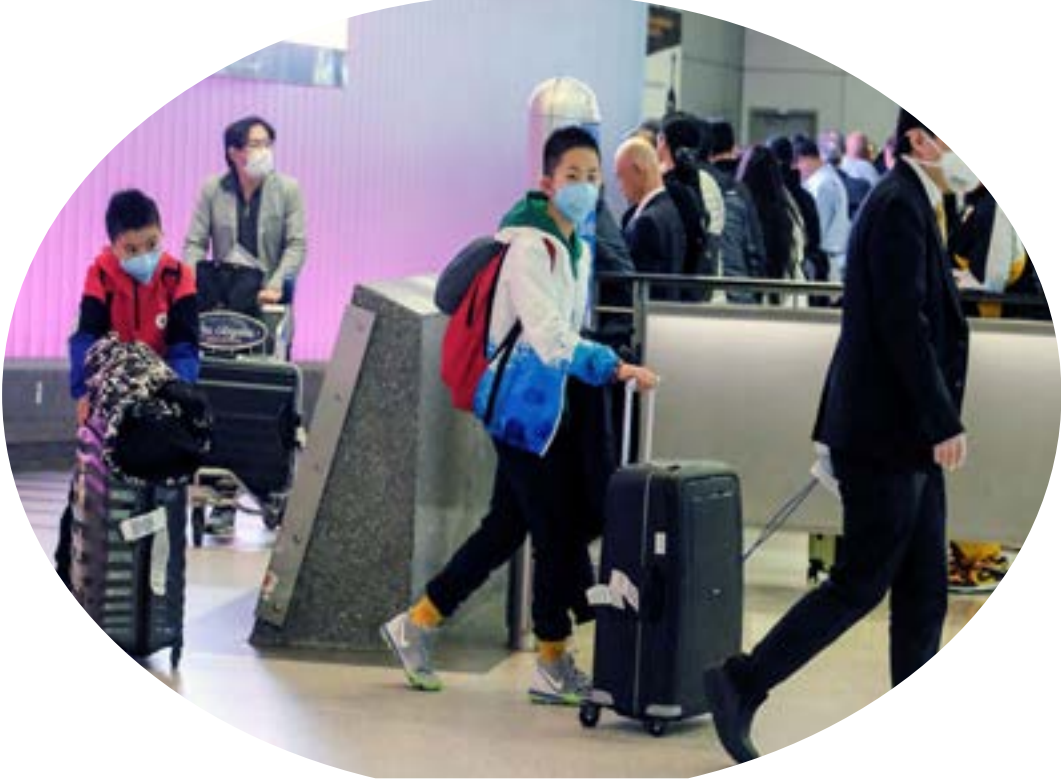
FILE PHOTO: Passengers arrive at LAX from Shanghai, China, after a positive case of the coronavirus was announced in the Orange County suburb of Los Angeles, California, U.S., January 26, 2020. REUTERS/Ringo Chiu/File Photo