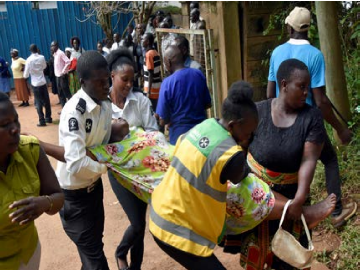
Medical staff assist a parent after she identified the body of her child killed in a stampede at the Kakamega Primary School in Kakamega