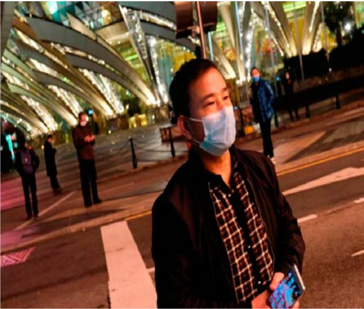
A man wearing mask walks in front of Casino Lisboa, before its temporary closing, following the coronavirus outbreak in Macau, China February 4, 2020.

But in the latest corporate hit, Hyundai Motor (005380.KS) said it