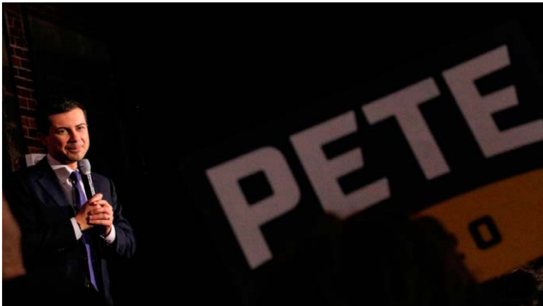
Democratic presidential candidate and former South Bend, Indiana mayor Pete Buttigieg speaks during a town hall campaign event in Manchester, New Hampshire, U.S., February 4, 2020.

DES MOINES, Iowa (Reuters) - Pete Buttigieg took a narrow lead in the first batch of long-delayed results from the chaotic Iowa Democratic Party caucuses on Tuesday, and former Vice President Joe Biden trailed badly in fourth place with about 62% of precincts reporting.