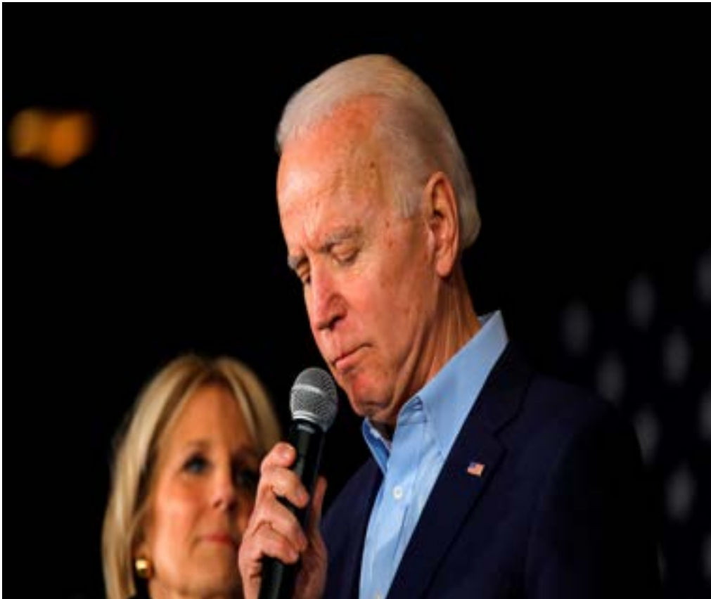
Democratic presidential candidate and former Vice President Joe Biden addresses supporters at a rally at the Drake University Olmsted Center in Des Moines, Iowa, U.S.