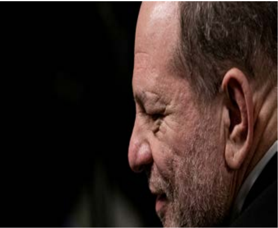
Film producer Harvey Weinstein leaves at New York Criminal Court for his sexual assault trial in the Manhattan borough of New York City