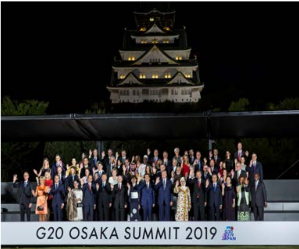
Japan's Prime Minister Shinzo Abe and other world leaders pose for a family photograph with their partners in front of Osaka Castle at the G-20 summit, in Osaka, Japan June 28, 2019