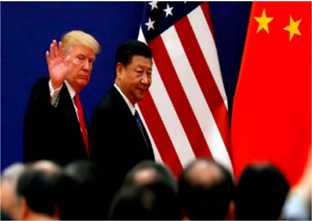
FILE PHOTO: U.S. President Donald Trump and China's President Xi Jinping meet business leaders at the Great Hall of the People in Beijing, China, November 9, 2017. REUTERS/Damir Sagolj/ File Photo