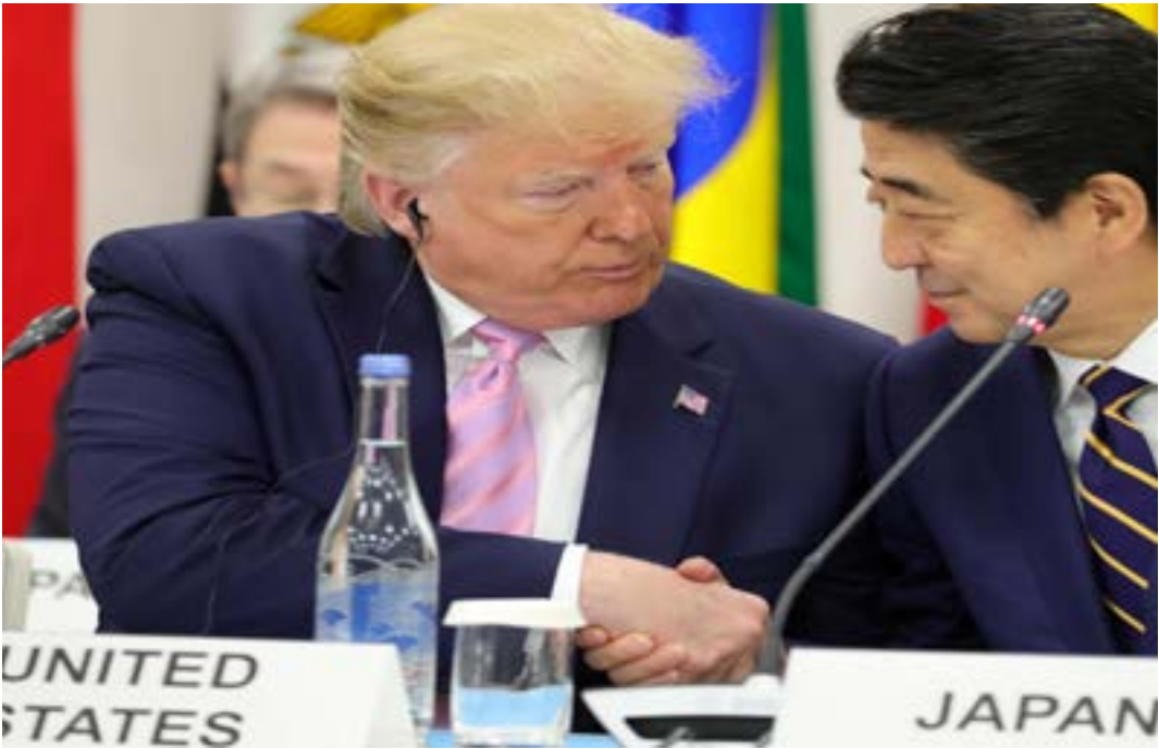
Japan's Prime Minister Shinzo Abe shakes hands with U.S. President Donald Trump during the G20 summit in Osaka, Japan June 28, 2019. Sputnik/Mikhail Klimentyev/ Kremlin via REUTERS ATTENTION EDITORS - THIS IMAGE WAS PROVIDED BY A THIRD PARTY.