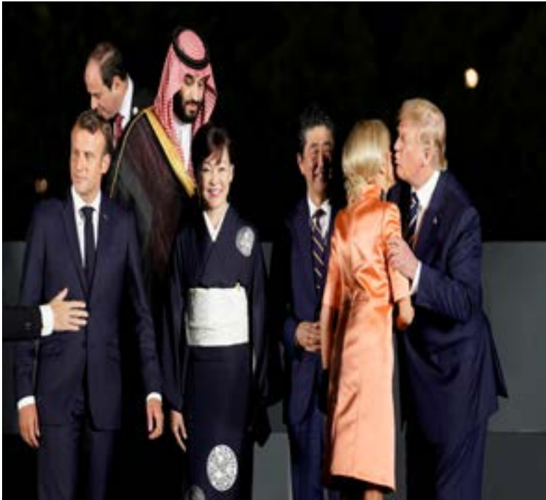
Trump kisses Brigitte Macron at the G20 leaders summit dinner in Osaka, Japan