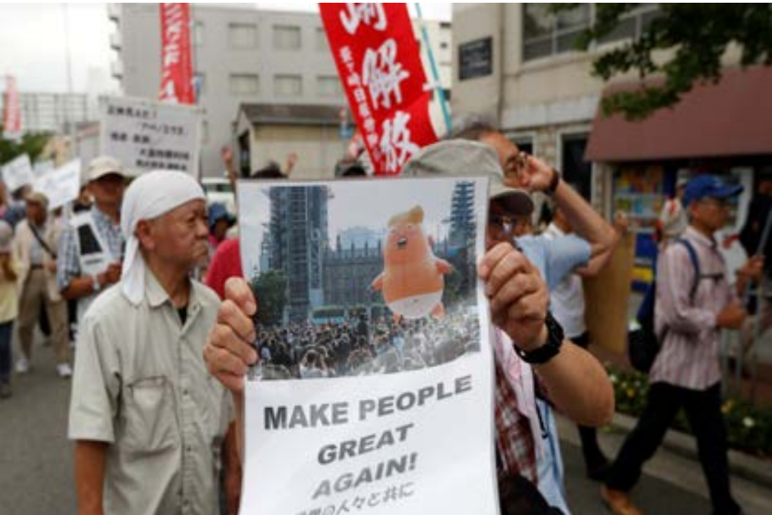
People participate in a demonstration against G20 during the leaders summit in Osaka, Japan June 28, 2019.