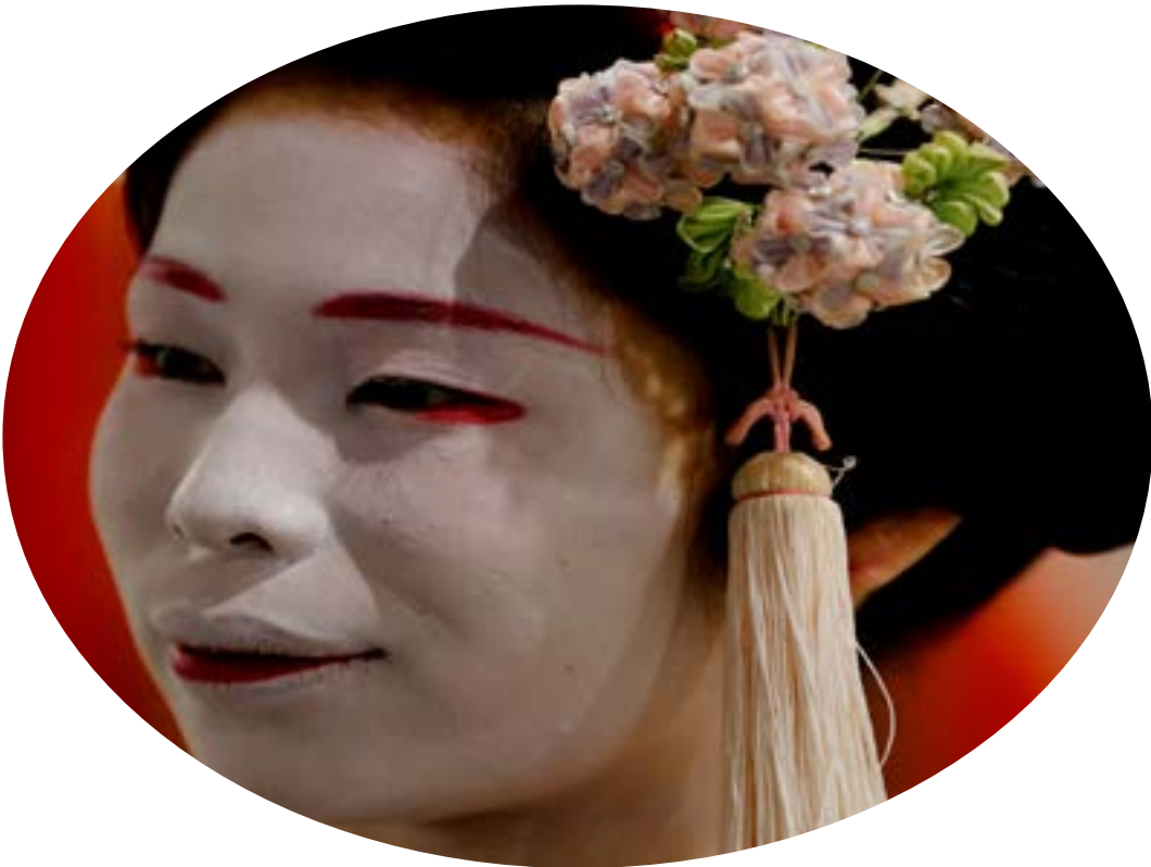
A maiko (apprentice geisha) attends a cultural exhibition at G20 leaders summit venue in Osaka, Japan, June 28, 2019.