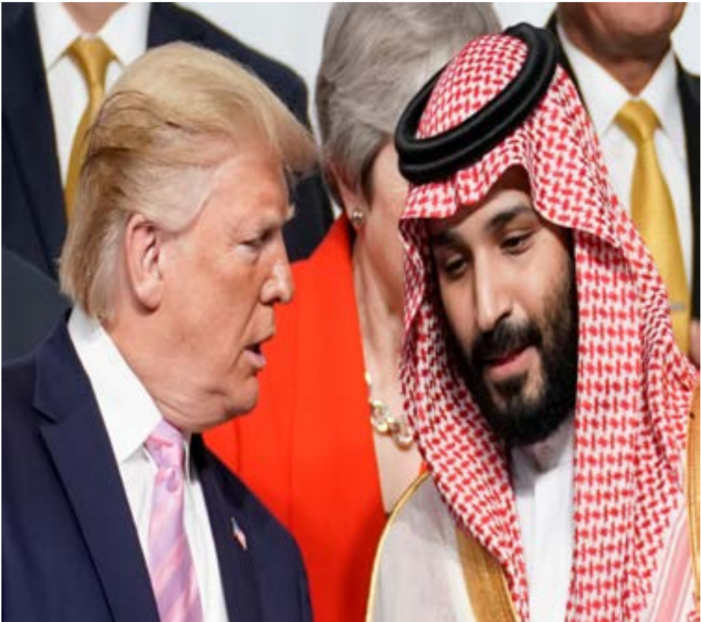
U.S. President Donald Trump speaks with Saudi Arabia's Crown Prince Mohammed bin Salman during family photo session with other leaders and attendees at the G20 leaders summit in Osaka, Japan, June 28, 2019. REUTERS/Kevin Lamarque TPX IMAGES OF THE DAY