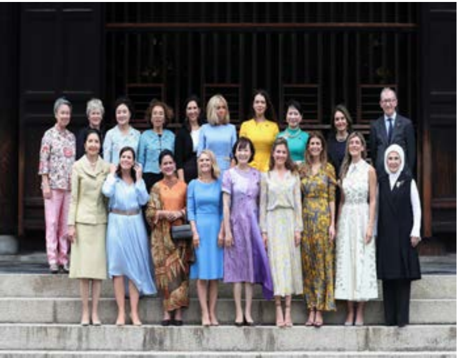
Partners of the G20 leaders pose for a family photo at G20 partners' program in Tofuku-ji Temple, Kyoto, Japan, June 28, 2019.