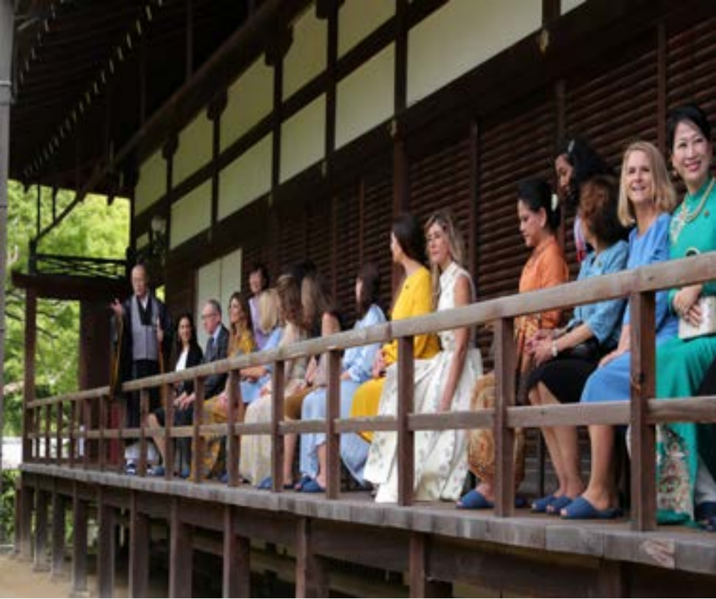
Partners of the G20 leaders enjoy a Japanese teatime during G20 partners' program at Tofuku-ji Temple in Kyoto, Japan, June 28, 2019.