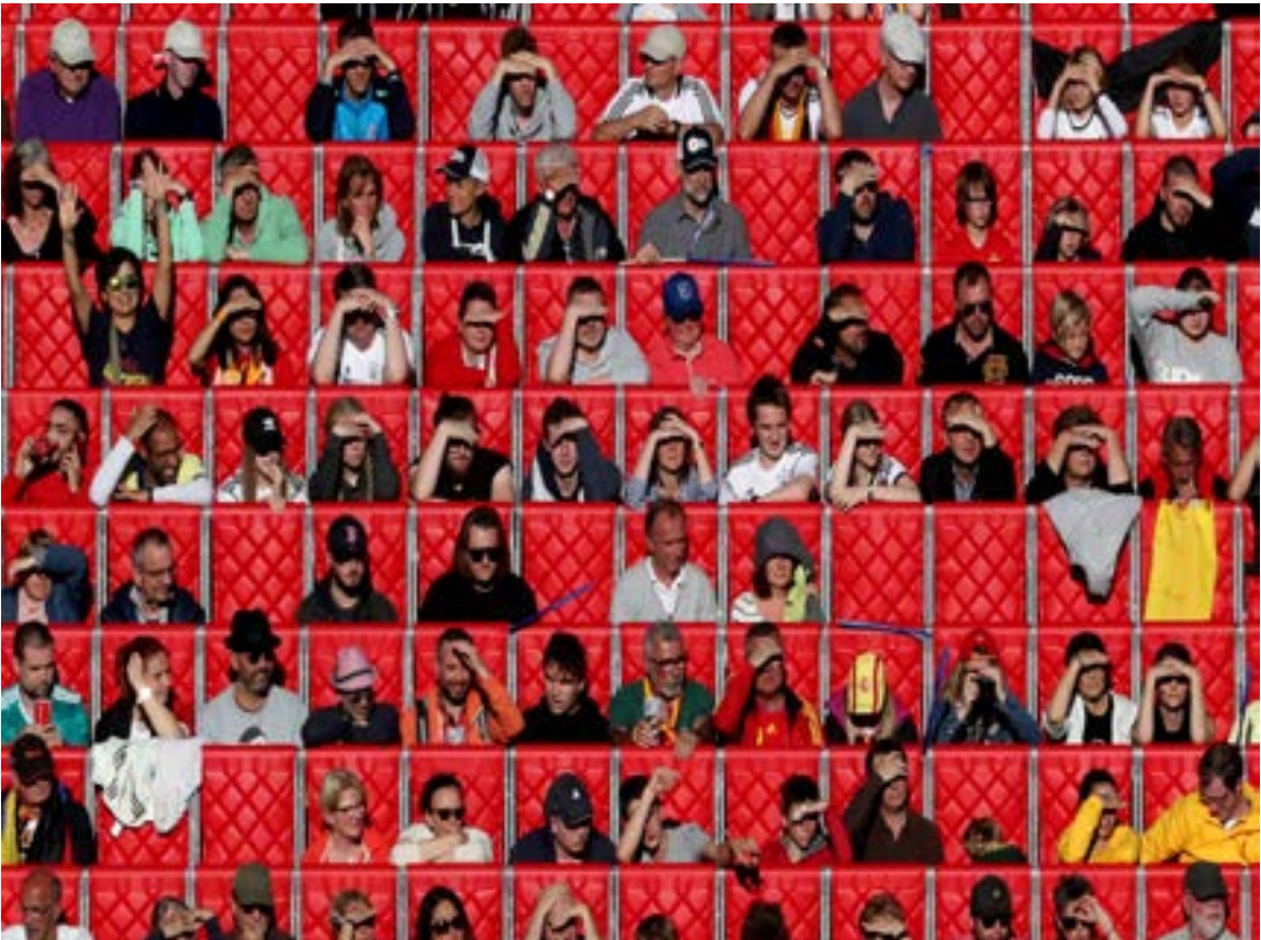
Spectators watch the Germany v Spain football match during the FIFA Women's World Cup in Valenciennes, France, June 12, 2019. Picture taken June 12, 2019. TPX IMAGES OF THE DAY