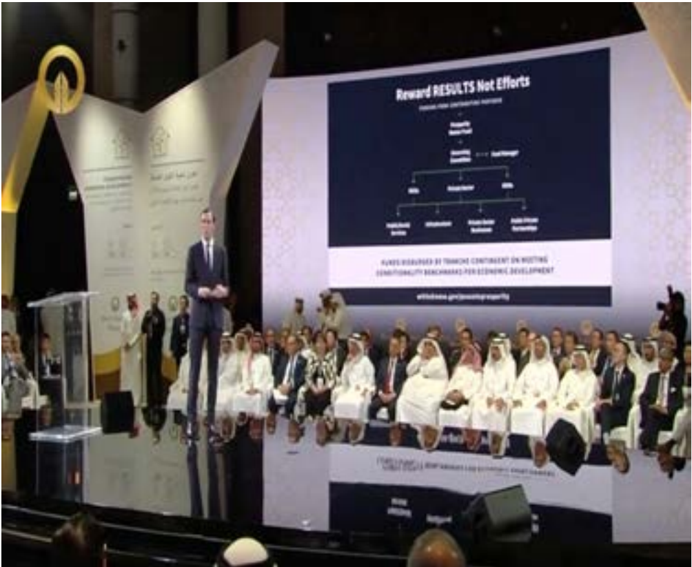
White House senior adviser Jared Kushner gives a speech at the opening of the “Peace to Prosperity” conference in Manama, Bahrain, June 25, 2019 in this still image taken from a video.