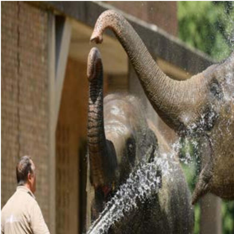
A zookeeper uses water to cool off elephants, as a heatwave is expected to reach the city, at Berlin Zoo, Germany June 25, 2019.