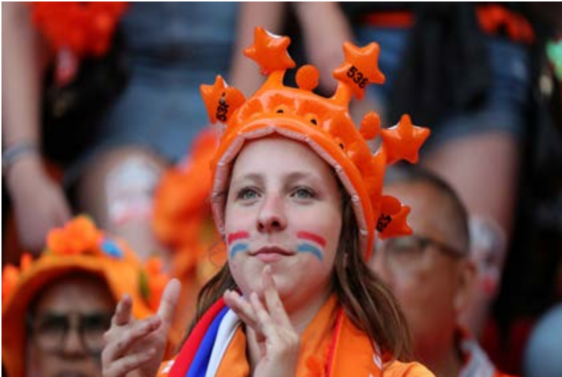
Soccer Football - Women's World Cup - Round of 16 - Netherlands v Japan - Roazhon Park, Rennes, France - June 25, 2019 Netherlands fan before the match