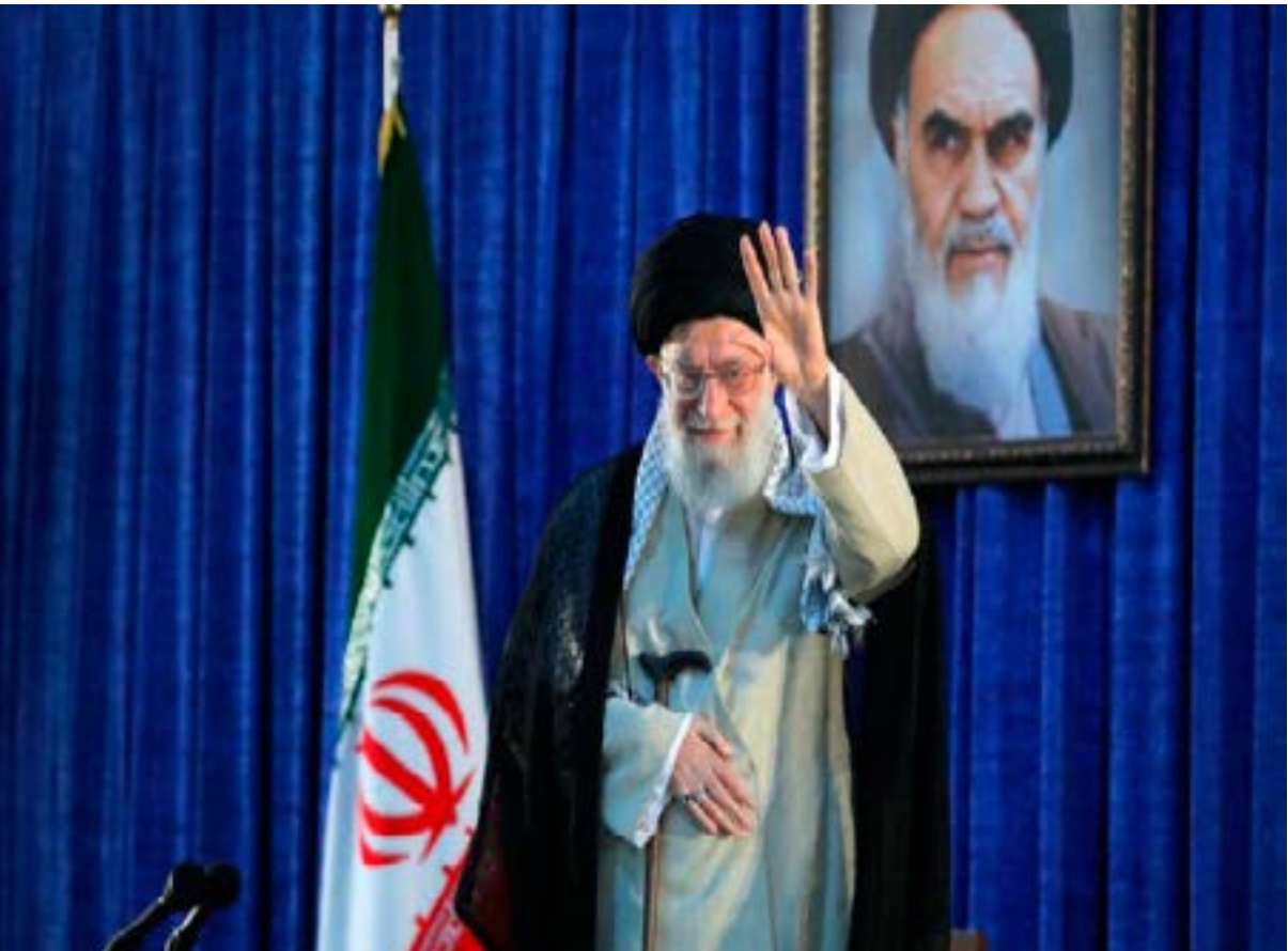
FILE PHOTO: Iran’s Supreme Leader Ayatollah Ali Khamenei waves his hand as he arrives to deliver a speech during a ceremony marking the 30th death anniversary of the founder of the Islamic Republic Ayatollah Ruhollah Khomeini in Tehran, Iran June 4, 2019.