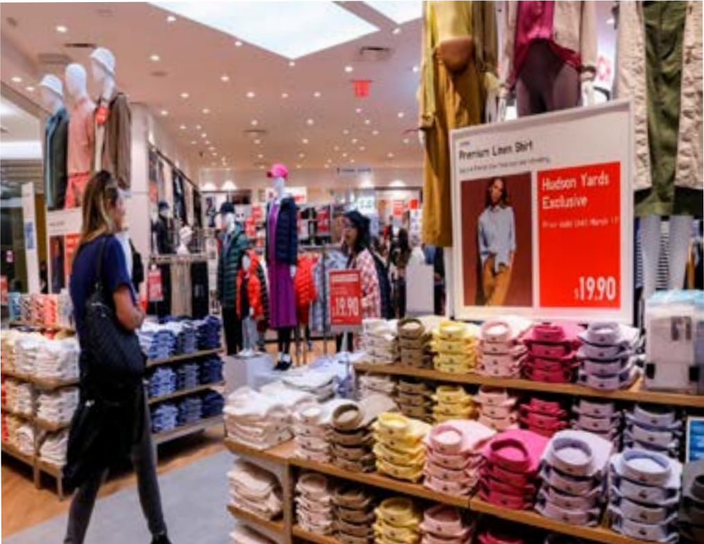
FILE PHOTO: People shop at an H&M store during the grand opening of the The Hudson Yards development, a residential, commercial, and retail space on Manhattan’s West side in New York City, New York, U.S., March 15, 2019.

of 121.5 this month, the lowest since September 2017, from a downwardly revised 131.3 in May. This month’s drop in the index was the largest since July 2015. The index, which was previously reported at 134.1 in May, still remains at lofty levels, suggesting consumer spending remains supported. The Conference Board blamed the decline on the trade tensions and cautioned that continued uncertainty “at some point, could even begin to diminish consumers’ confidence in the expansion.” The economy will mark 10 years of growth next month, the longest expansion on record. President Donald Trump last month imposed additional tariffs of up to 25% on $200 billion of Chinese goods, prompting retaliation by Beijing. Trump has threatened more duties on Chinese imports if no deal is reached at a Group of 20 nations summit this week in Japan. Economists polled by Reuters had forecast the consumer confidence index at 131.1 in June.