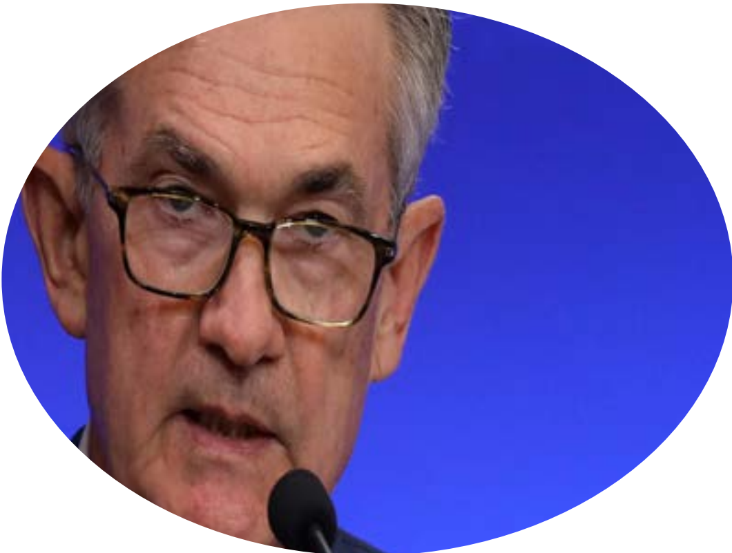
Federal Reserve Chairman Jerome Powell speaks at the Council on Foreign Relations in New York