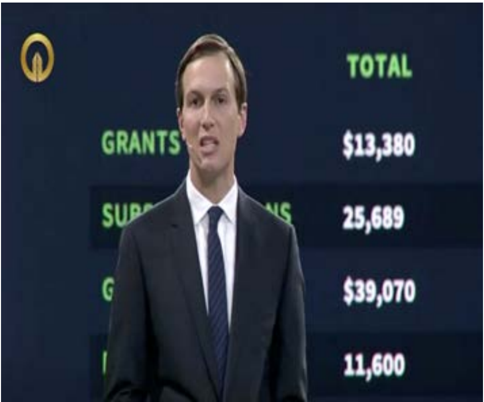
White House senior adviser Jared Kushner gives a speech at the opening of the “Peace to Prosperity” conference in Manama