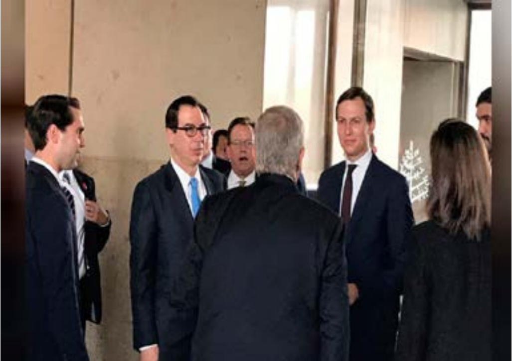
White House senior adviser Jared Kushner and Treasury Secretary Steven Mnuchin arrive at Manama's Four Seasons hotel, the venue for the U.S.-hosted "Peace to Prosperity" conference, in Manama, Bahrain, June 25, 2019.