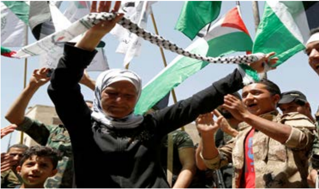
A Palestinian refugee dances at Yarmouk Palestinian camp in Damascus