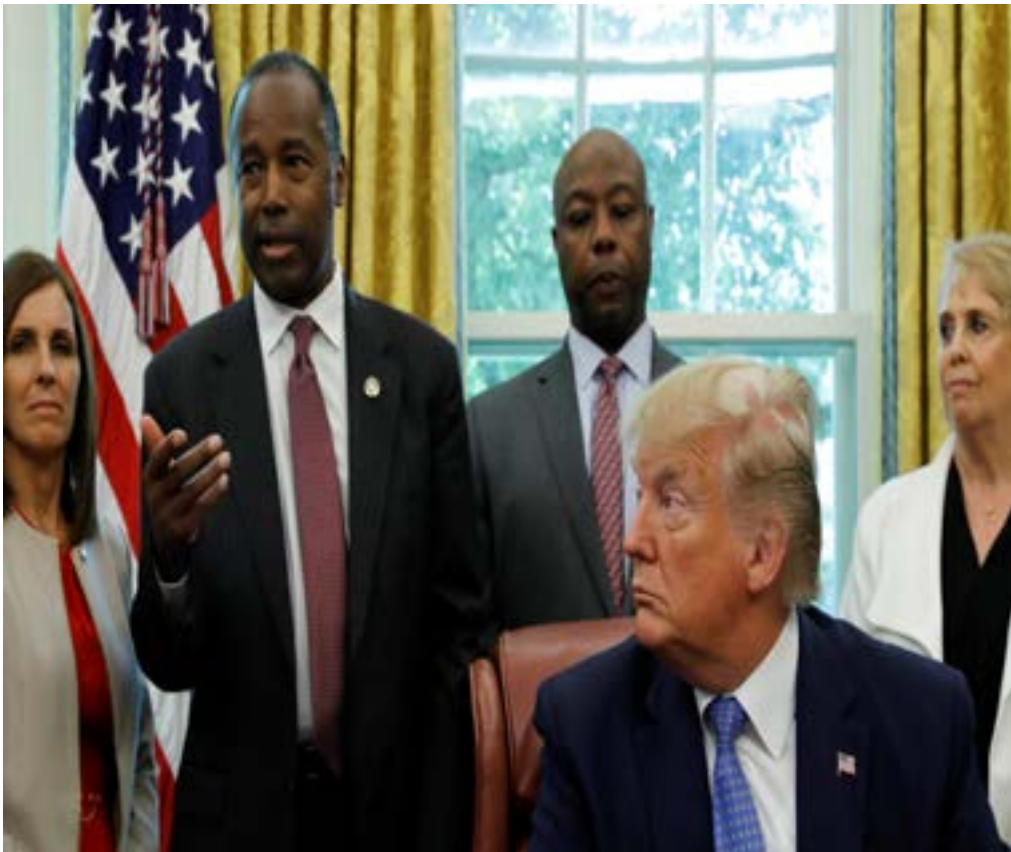
U.S. President Trump signs executive order on plan to create affordable housing council at White House in Washington