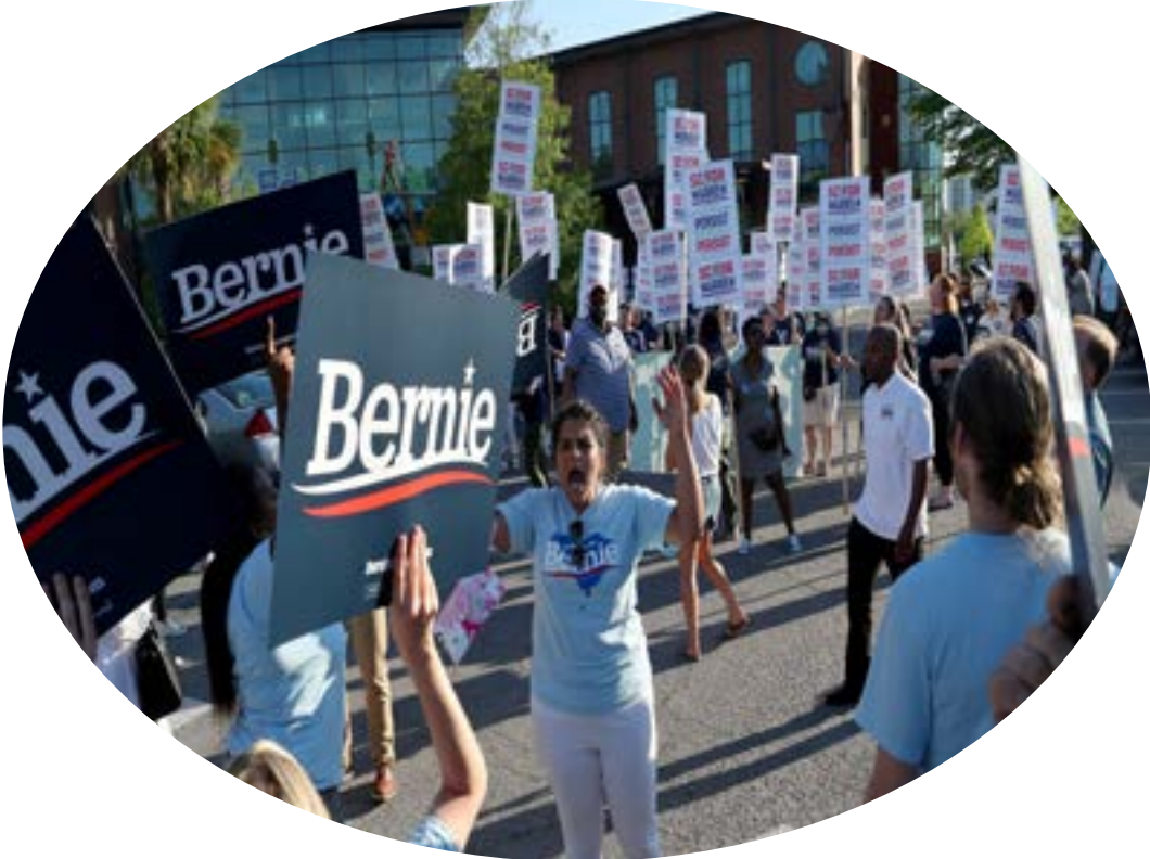
Supporters of Democratic presidential candidate Sen. Bernie Sanders try to chant louder than supporters of candidate Sen. Elizabeth Warren outside of Jim Clyburn's World Famous Fish Fry in Columbia, South Carolina, U.S., June 21, 2019. TPX IMAGES OF THE DAY