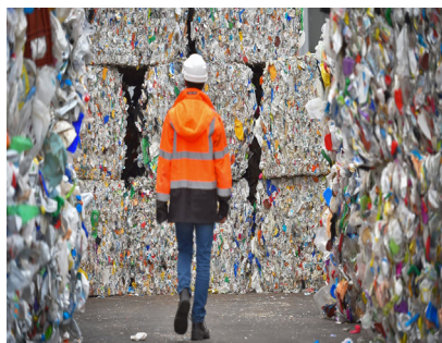
A sorting center in France. Photo: