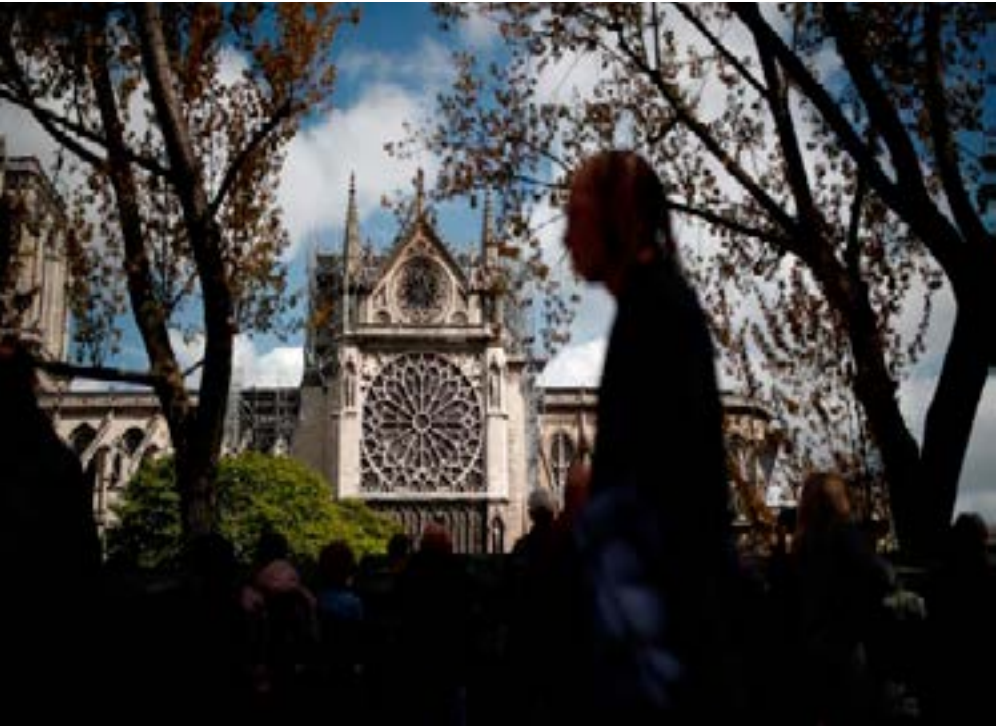
People gather as they look at Notre-Dame Cathedral two days after a massive fire devastated large parts of the gothic structure in Paris, France, .

The city’s public prosecutor, Remy Heitz, said on Tuesday there was no sign of arson and it was likely to have been the result of an accident. Some 50 people were working on what would be a long and complex investigation, he said. Passers-by laid flowers on bridges crossing the Seine River as Parisians gave thanks to see the bell towers standing valiantly after the fire. Notre-Dame is not the first French cathedral to suffer a devastating fire. Among past catastrophes, a 1972 fire engulfed the roof of Saint-Pierre-et-Saint-Paul de Nantes. Concrete was used in the subsequent reconstruction of gables and roof beams.