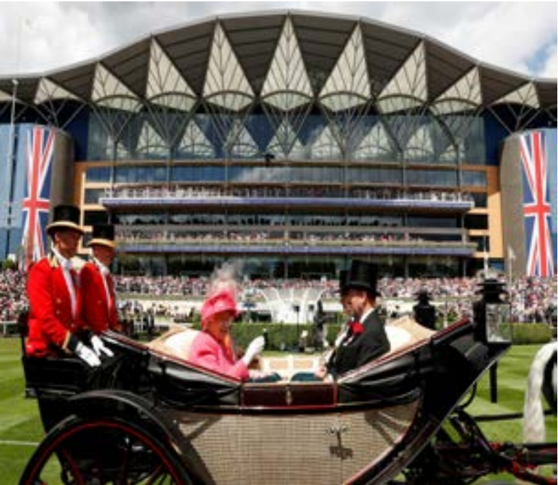
Horse Racing - Royal Ascot - Ascot Racecourse, Ascot, Britain - June 21, 2019 Britain's Queen Elizabeth arrives at ascot TPX IMAGES OF THE DAY