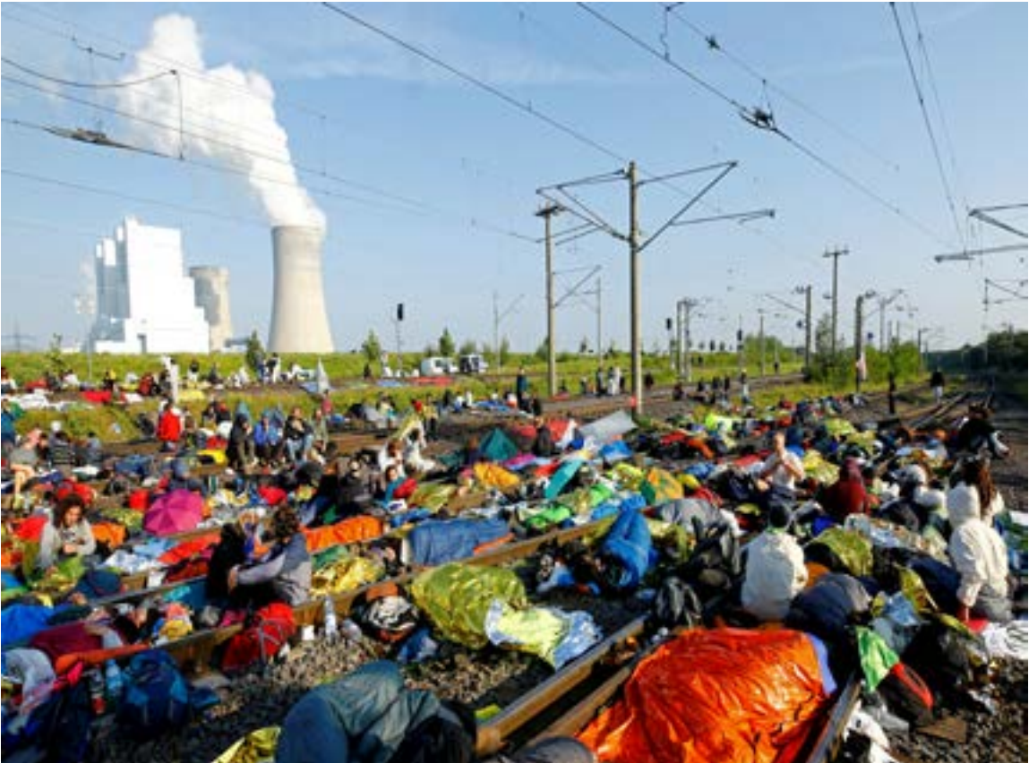
Protest against the climate change near Garzweiler open cast brown coal mine near Rommerskirchen