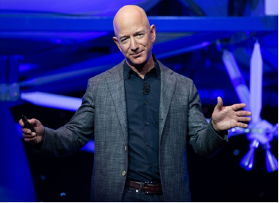
Blue Origin founder Jeff Bezos