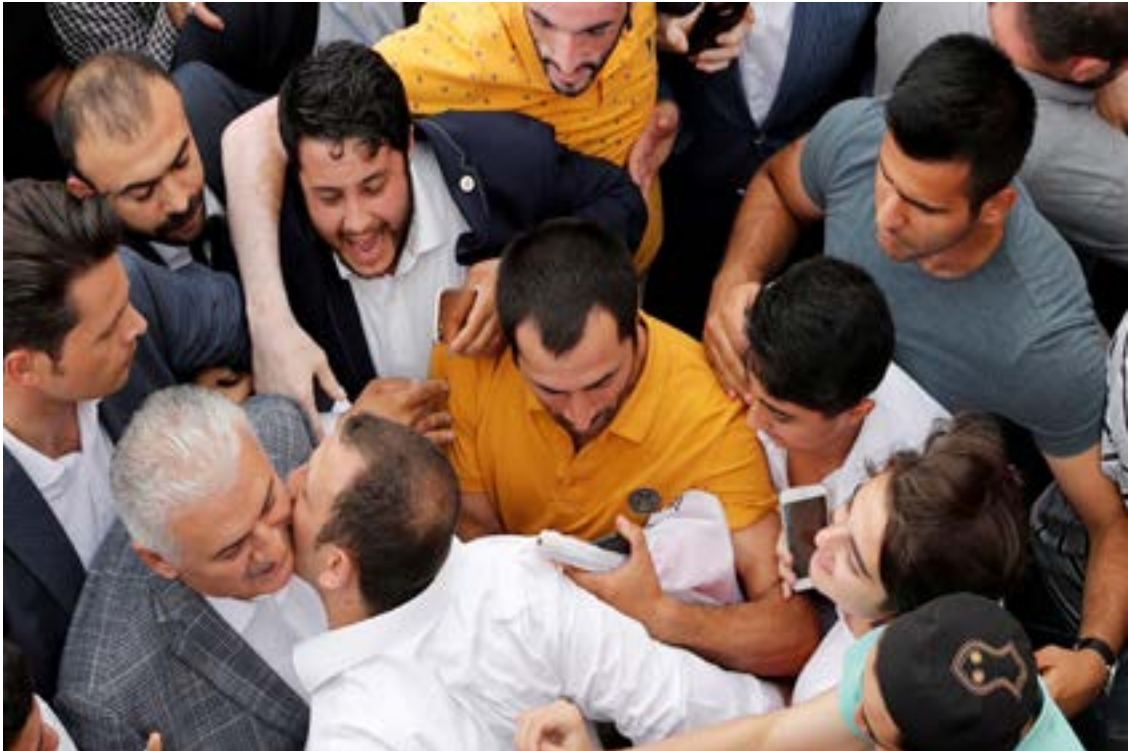
Binali Yildirim, Istanbul mayoral candidate of the ruling AKP, is surrounded by his supporters his supporters during an election rally in Istanbul