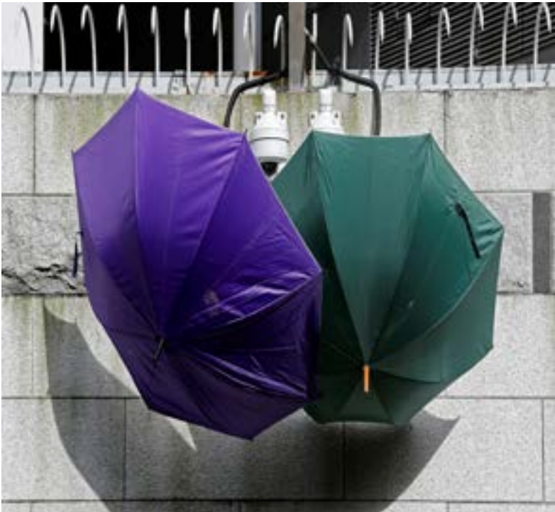
Umbrellas are placed to block security cameras outside a police headquarters, during a demonstration demanding Hong Kong's leaders to step down and withdraw the extradition bill, in Hong Kong