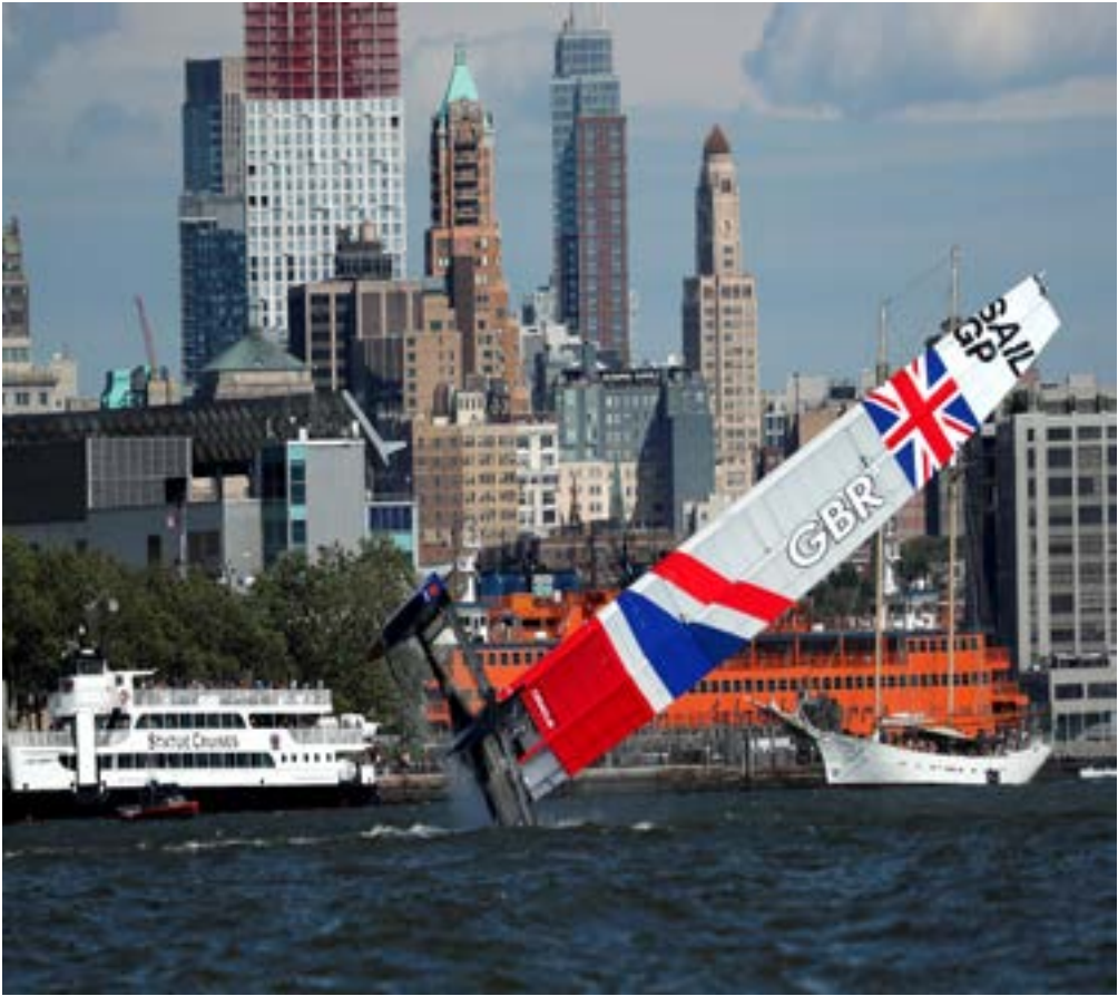
SailGP Team Great Britain skippered by Dylan Fletcher capsizes ahead of race one of day one of competition in the SailGP global sailboat racing series in New York harbor, New York, U.S., June 21, 2019. REUTERS/Mike Segar TPX IMAGES OF THE DAY