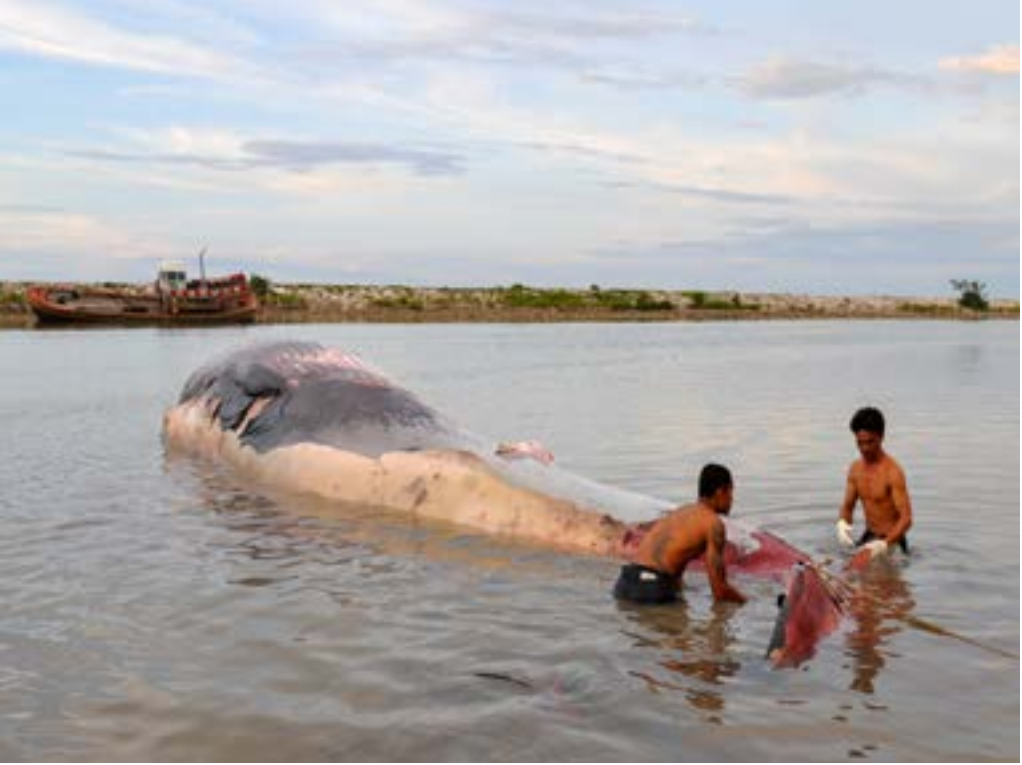
Fishermen try to tow a dead Bryde's whale in Surat Thani province