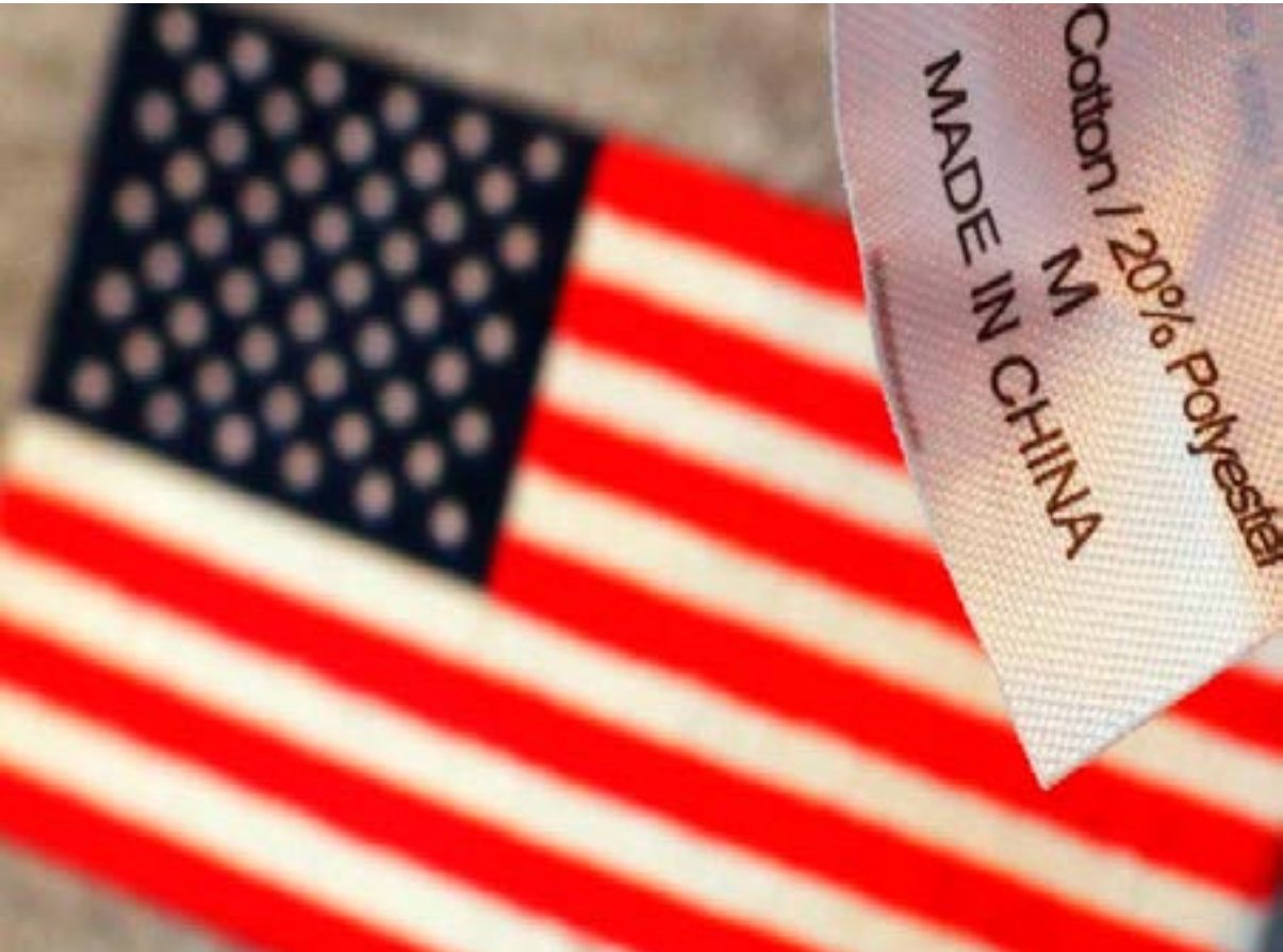
The label reading "Made in China" on a sweatshirt is seen over another shirt with a U.S. flag at a souvenir stand in Boston, Massachusetts January 18, 2011.