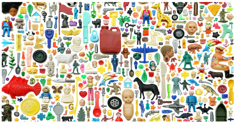
Assembled plastic objects found on the UK coast, 1994-2019.