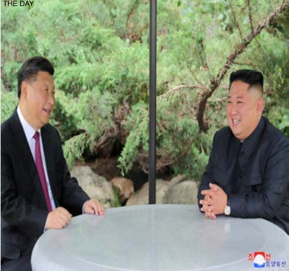
Chinese President Xi Jinping and North Korean leader Kim Jong Un take a walk in Pyong-yang