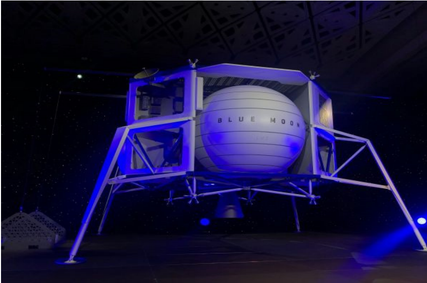
Blue Origin’s “Blue Moon” lunar lander.

Overview Blue Origin founder Jeff Bezos unveiled the company’s “Blue Moon” lunar lander on Thursday, as well as a new BE-7 rocket engine. “I love Vice President Pence’s 2024 lunar landing goal,” Bezos said, adding that Blue Origin can meet that timeline “because we started this three years ago.” Bezos invests more than $1 billion in Blue Origin each year, through sales of his Amazon shares.