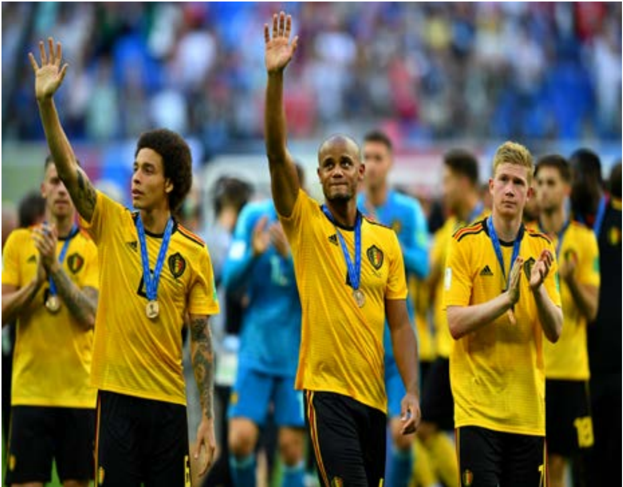
Soccer Football - World Cup - Third Place Play Off - Belgium v England - Saint Petersburg Stadium, Saint Petersburg, Russia - July 14, 2018 Belgium's Axel Witsel, Vincent Kompany and Kevin De Bruyne after receiving the bronze World Cup medal TPX IMAGES OF THE DAY