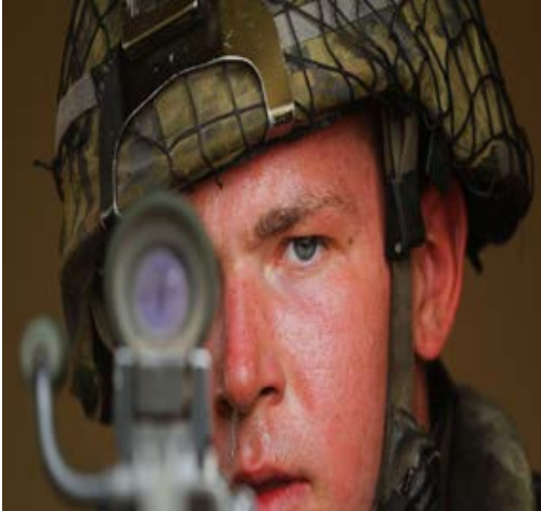
A Canadian soldier with the Royal 22e Regiment takes aim from his position as they conduct assault operations during a Rim of the Pacific (RIMPAC) exercise with U.S. Marines at Camp Pendleton