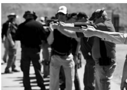
Taking aim at the target.