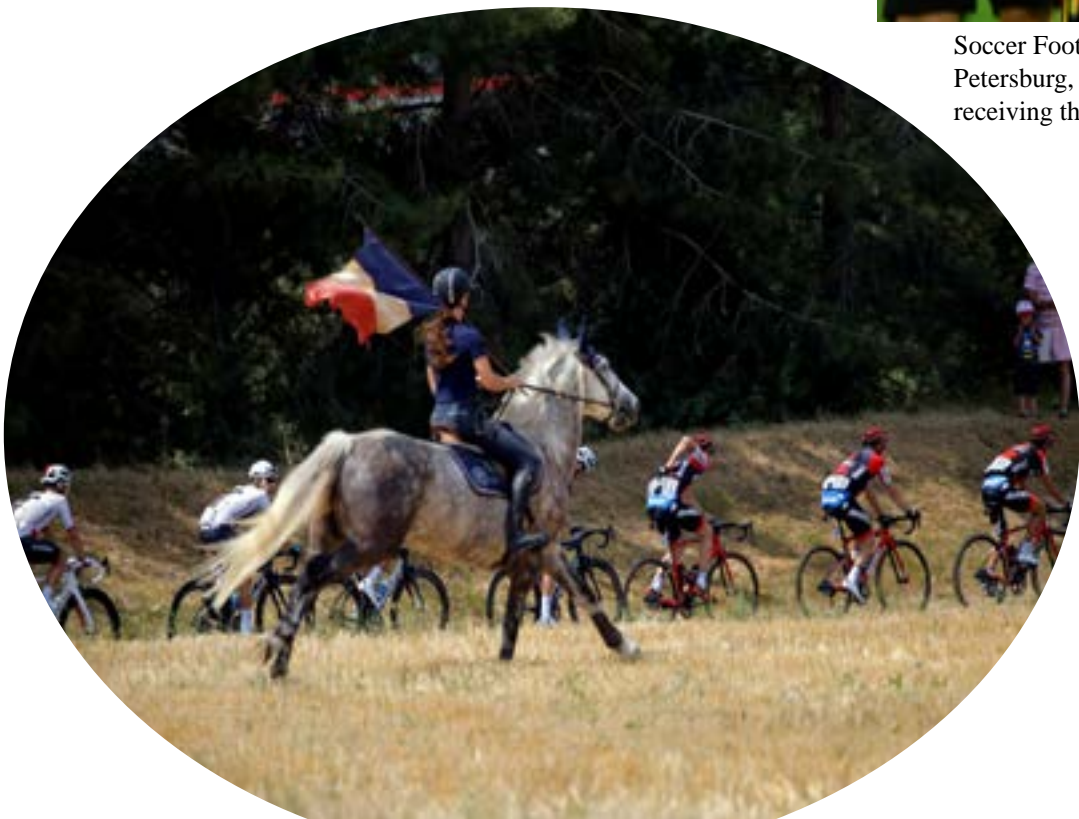
Cycling - Tour de France - The 181-km Stage 8 from Dreux to Amiens Metropole - July 14, 2018 - A woman on a horse carries the French flag on Bastille Day as the peloton passes by.