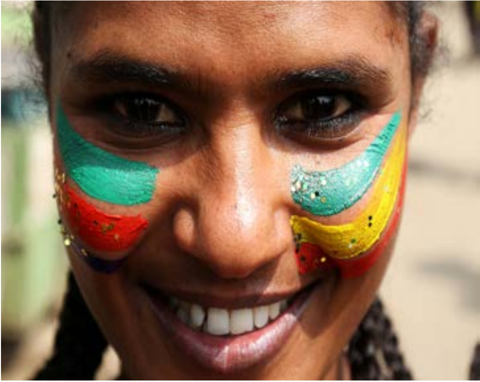
A woman with a face painting of the Ethiopia national flag attends a ceremony to welcome Eritrea's President Isaias Afwerki for a three-day visit, at the Bole international airport in Addis Ababa