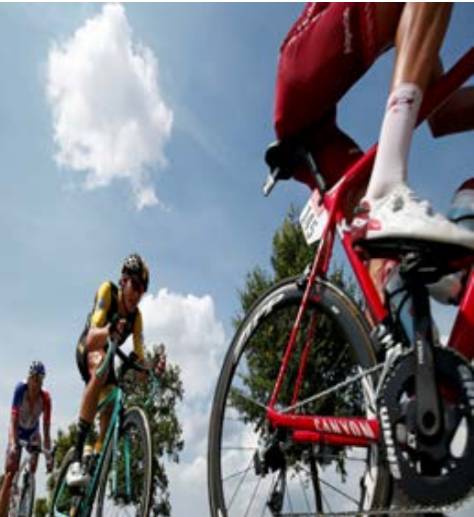
Cycling - Tour de France - The 231-km Stage 7 from Fougères to Chartres - July 13, 2018 - LottoNL-Jumbo rider Amund Grondahl Jansen of Norway in action. REUTERS/Benoit Tessier TPX IMAGES OF THE DAY