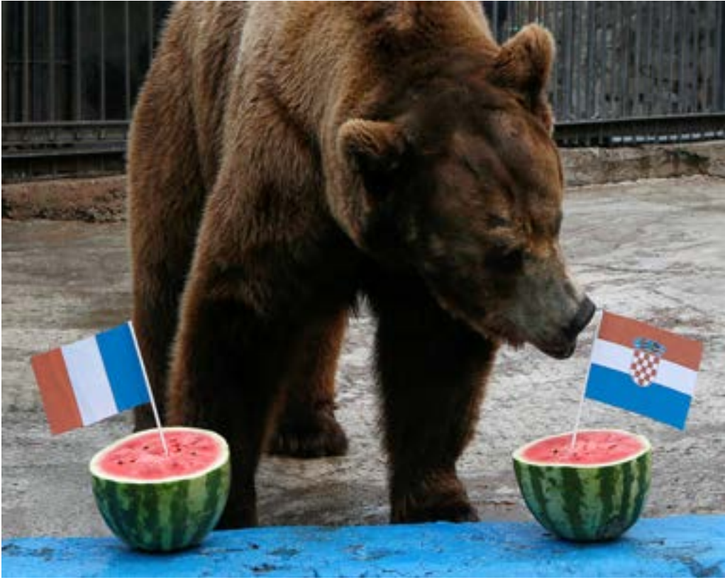
A bear attempts to predict the result of the World Cup final between France and Croatia at a zoo in Krasnoyarsk