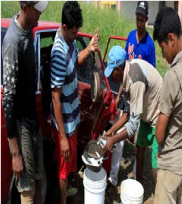
A man weighs fish that he intends to barter for basic staples in Rio Chico