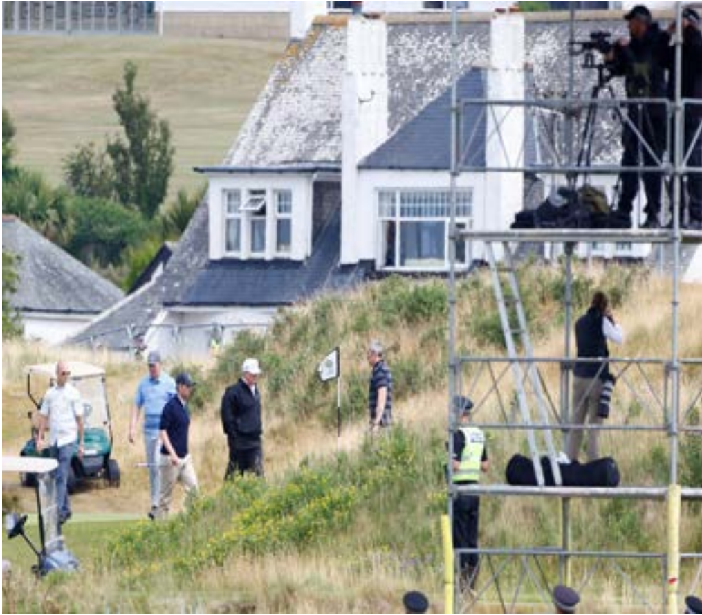
U.S. President Donald Trump walks at his golf resort under the gaze of armed police officers, in Turnberry