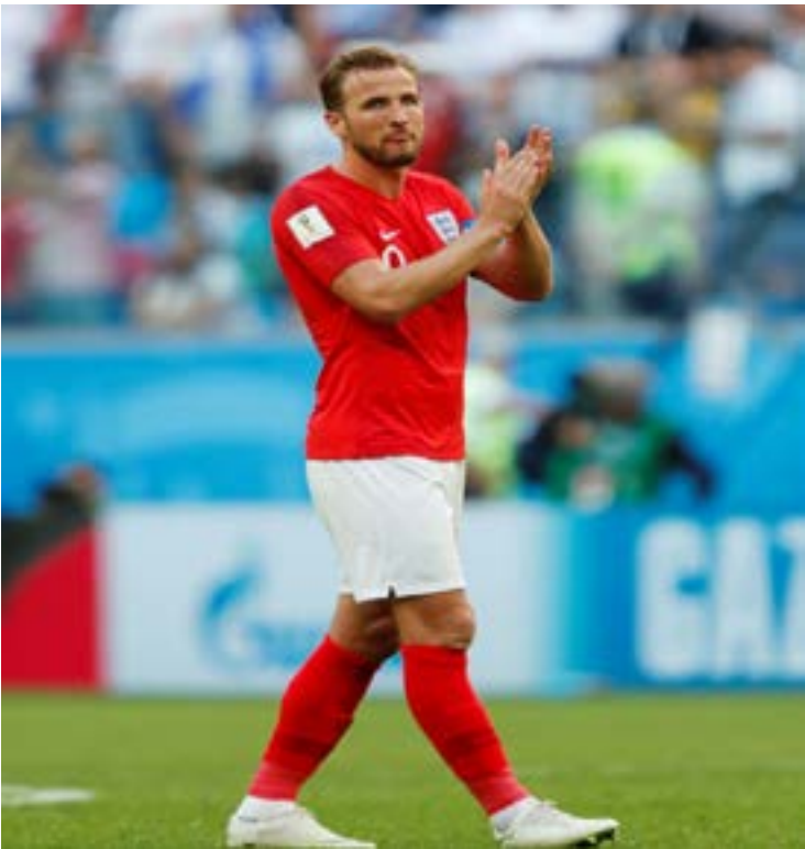
Soccer Football - World Cup - Third Place Play Off - Belgium v England - Saint Petersburg Stadium, Saint Petersburg, Russia - July 14, 2018 England's Harry Kane applauds the fans after the match TPX IMAGES OF THE DAY