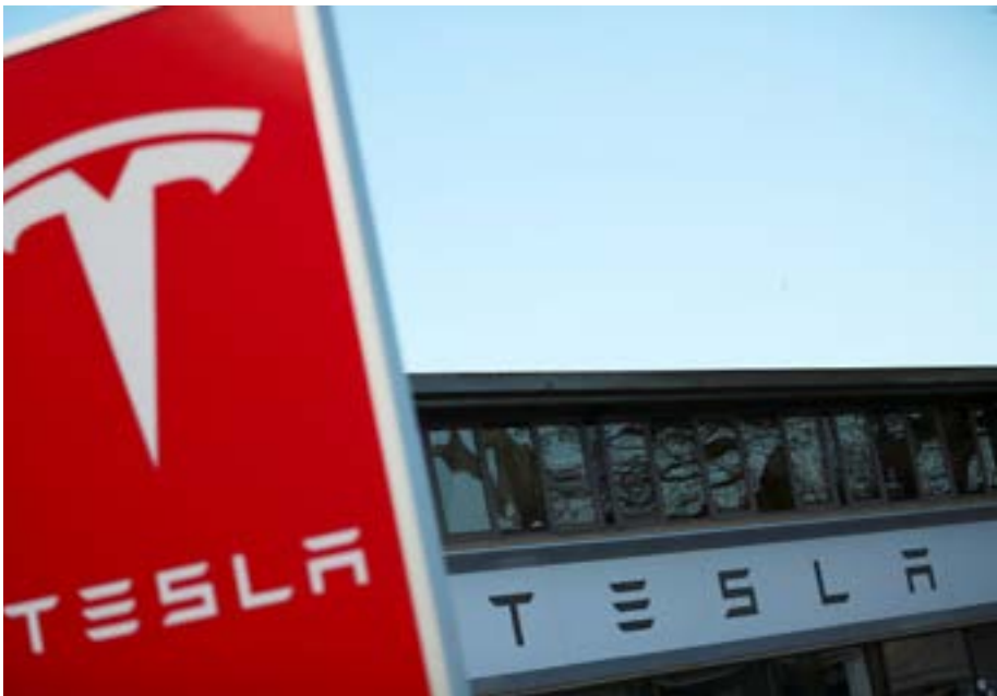
A Tesla dealership is seen in West Drayton, just outside London

A truck runs around 65,000-100,000 miles a year, and Tesla has promised a 20-percent saving on the per-mile operating costs truckers pay now, estimating its new Semi will cost $1.26 per mile compared to what it says are industry standards of around $1.51 for diesel trucks. Analysts, however, say the figures continue to evolve; the $1.51 cost assumes prices for diesel fuel and that fuel economy costs remain static.