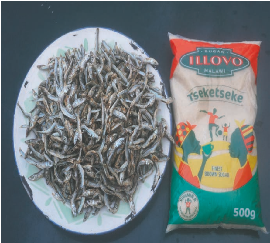
Usipa fish and locally manufactured sugar, both used to deal with fall armyworm in the absence of chemicals, Chambu village in Lilongwe district, Malawi, February 7, 2018