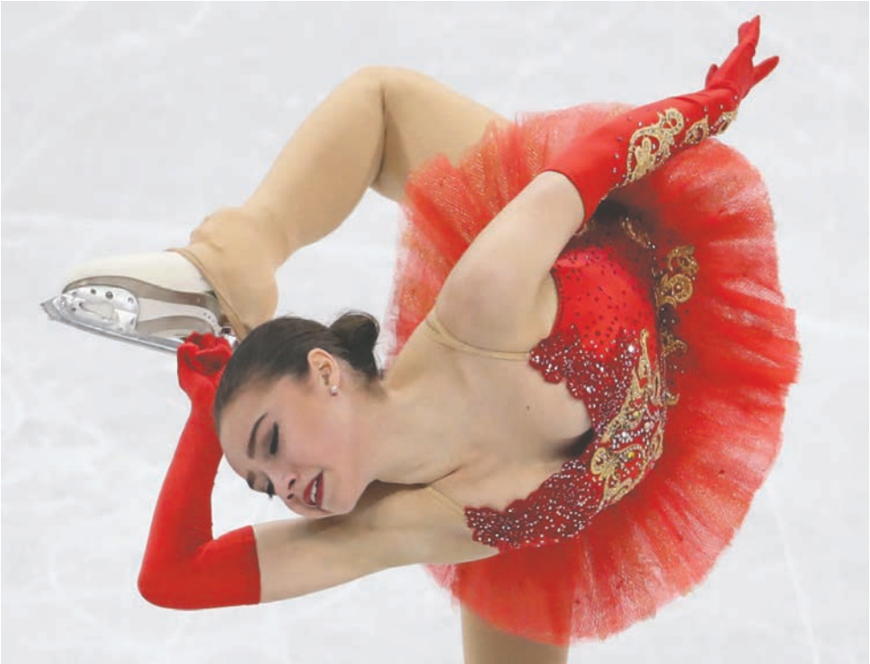
Figure Skating - Pyeongchang 2018 Winter Olympics - Women Single Skating free skating competition final - Gangneung Ice Arena - Gangneung, South Korea - February 23, 2018 - Alina Zagitova, an Olympic Athlete from Russia, comp