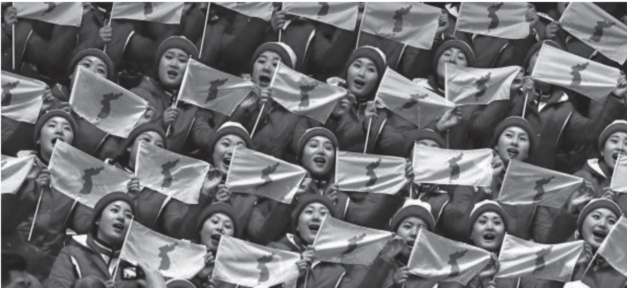
South Koreans who have been bearing witness to the rapid detente between North and South Korea at the 2018 Pyeongchang Winter Olympics strongly endorse South Korean President Moon Jae-in's cautious approach to North Korea human rights.