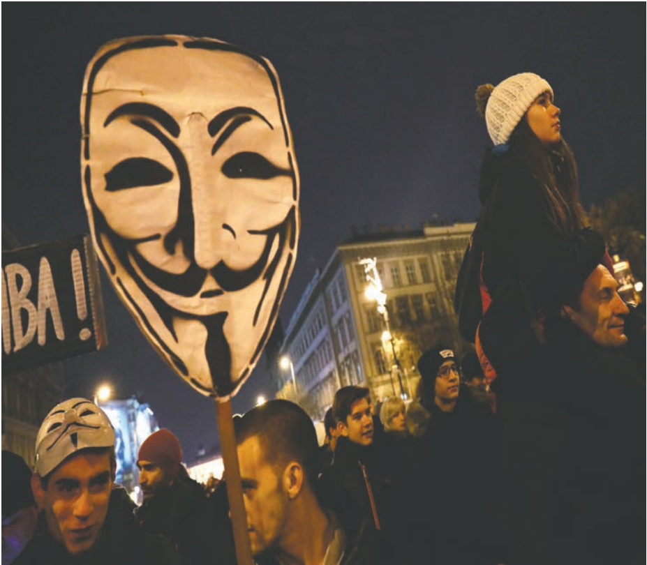
Protesters rally during a student-organized anti-government demonstration in Budapest