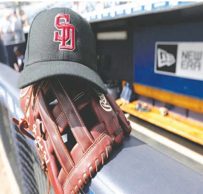
Feb 23, 2018; Tampa, FL, USA; New York Yankees and Detroit Tigers wear the caps of the Marjory Stoneman Douglas High School (MSDHS) baseball team, the Stoneman Douglas Eagles, prior to the game at George M. Steinbrenner Field to honor the victims of this senseless act of violence and to show support for the Parkland, Fla., community.