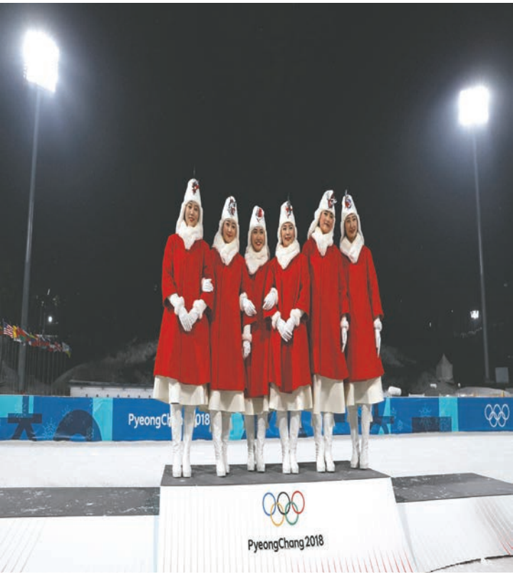
Hostesses pose on the podium at the end of the biathlon competitions at the Alpensia Biathlon Centre in Pyeongchang