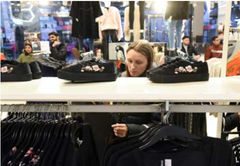
FILE PHOTO: A woman shops at an H&M store in New York City, U.S. December 23, 2017. GLOBAL BUSINESS WEEK AHEAD SEARCH

"We want more shock absorbers out there and really ... the main shock absorber is the ability to reduce the fed funds rate, which means that you want to get to a higher inflation rate so that the pre-shock fed funds rate is 4 and not 2," said Paul Krugman, the Nobel Prize-winning economist and professor at City University of New York. In a speech to the conference hosted by the University of Chicago Booth School of Business, Krugman said every recession since 1982 has been caused by "private sector over-reach" and not Fed tightening, as in decades past. The conference's main research paper argued the central bank should focus on