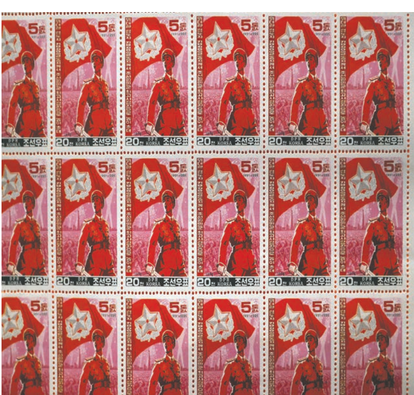
Stamp sheets are seen on display at the ‘Made in North Korea: Everyday Graphics from the DPRK’ exhibition in London