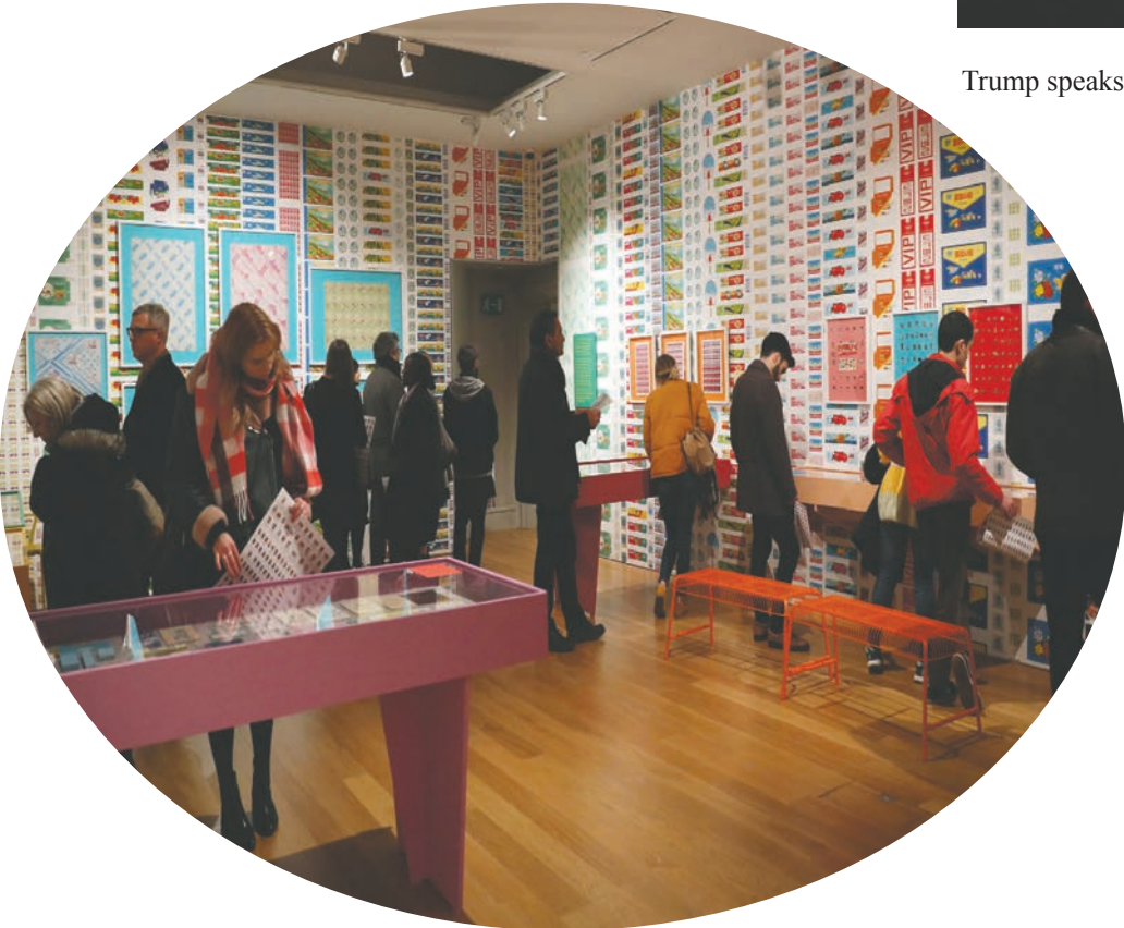
Visitors look at items on display at the ‘Made in North Korea: Everyday Graphics from the DPRK’ exhibition in London