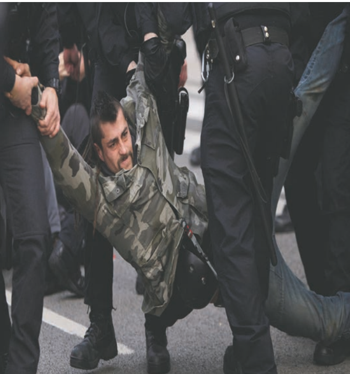
Mossos d’Esquadra officers remove people from the door of the Catalonia’s Supreme Court during a protest called by the “Defense Committee of the Republic” in Barcelona