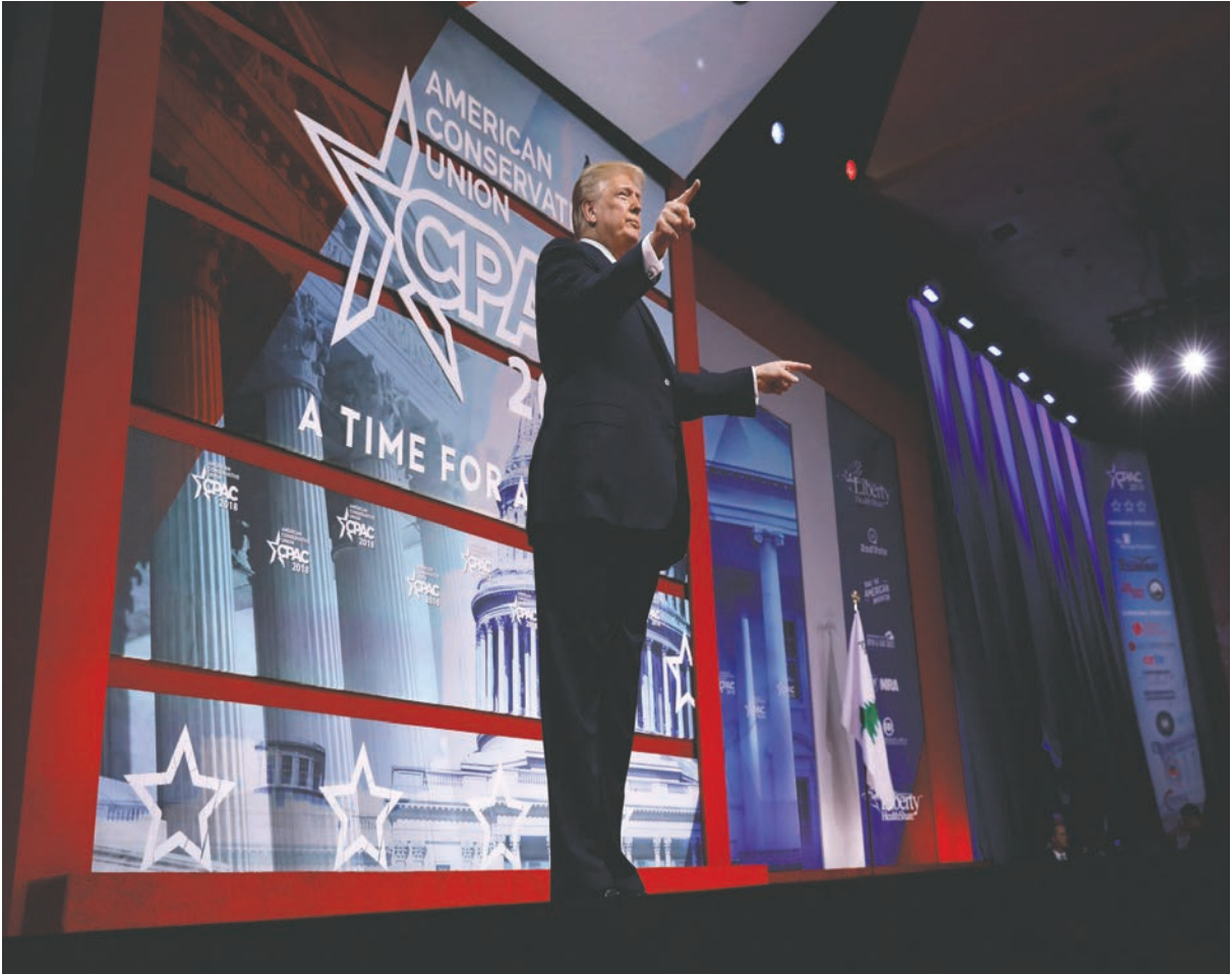
Trump speaks at the CPAC conference at National Harbor, Maryland