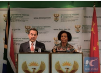
Chinese Foreign Minister Wang Yi (L) and Maite Nkoana-Mashabane, Minister of the Department of International Relations and Cooperation of South Africa attend a press conference in Pretoria, South Africa in April, 2015.

"Thanks to our joint efforts in the past three years and more, solid progress has been made in follow up actions in the five key areas adopted at the 5th ministerial conference in Beijing," Wang remarked. He added the Chinese government has prioritized key areas like finance and investment, peace and security, people to people exchanges and regional integration to boost Africa's socio-economic progress. The FOCAC summit will provide an opportunity for China and African states to dialogue on viable strategies that would accelerate the continent's development. Wang said China will engage African countries on a mutual basis to help them address pressing challenges like poverty, youth unemployment, skills and infrastructural bottlenecks.