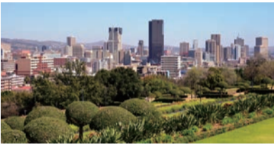
Pretoria, South Africa

He added that Sino-Africa dialogue on environmental protection and development of industrial parks has progressed without a hitch.