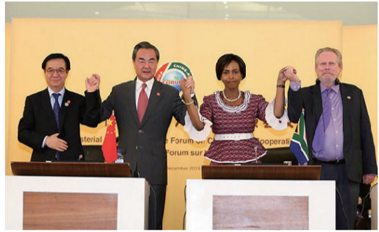
Chinese Foreign Minister Wang Yi (2nd L), Chinese Commerce Minister Gao Hucheng (1st L), South African Minister for international relations and cooperation Nkoana Mashabane (2nd R) and South African Minister of Trade and Industry Rob Davies attend the 6th ministerial conference of the Forum on China-Africa Cooperation (FOCAC) in Pretoria, South Africa, Dec. 3, 2015.

Compiled And Edited By John T. Robbins, News&Review Editor